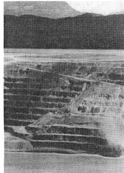
Blasting the 128-foot barrier wall to

The mine is immediately adjacent to the ocean. Indeed a 128-ft deep barrier wall had to be constructed to prevent the sea from flowing into the pit, which reached a maximum depth of 1320 feet below sea level, the lowest man-made spot on the earth's surface