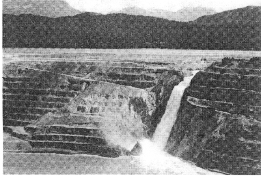
Blasting the 128-foot barrier wall to let the sea reclaim the Island Copper Mine.

The mine is immediately adjacent to the ocean. Indeed a 128-ft deep barrier wall had to be constructed to prevent the sea from flowing into the pit, which reached a maximum depth of 1320 feet below sea level, the lowest man-made spot on the earth's surface