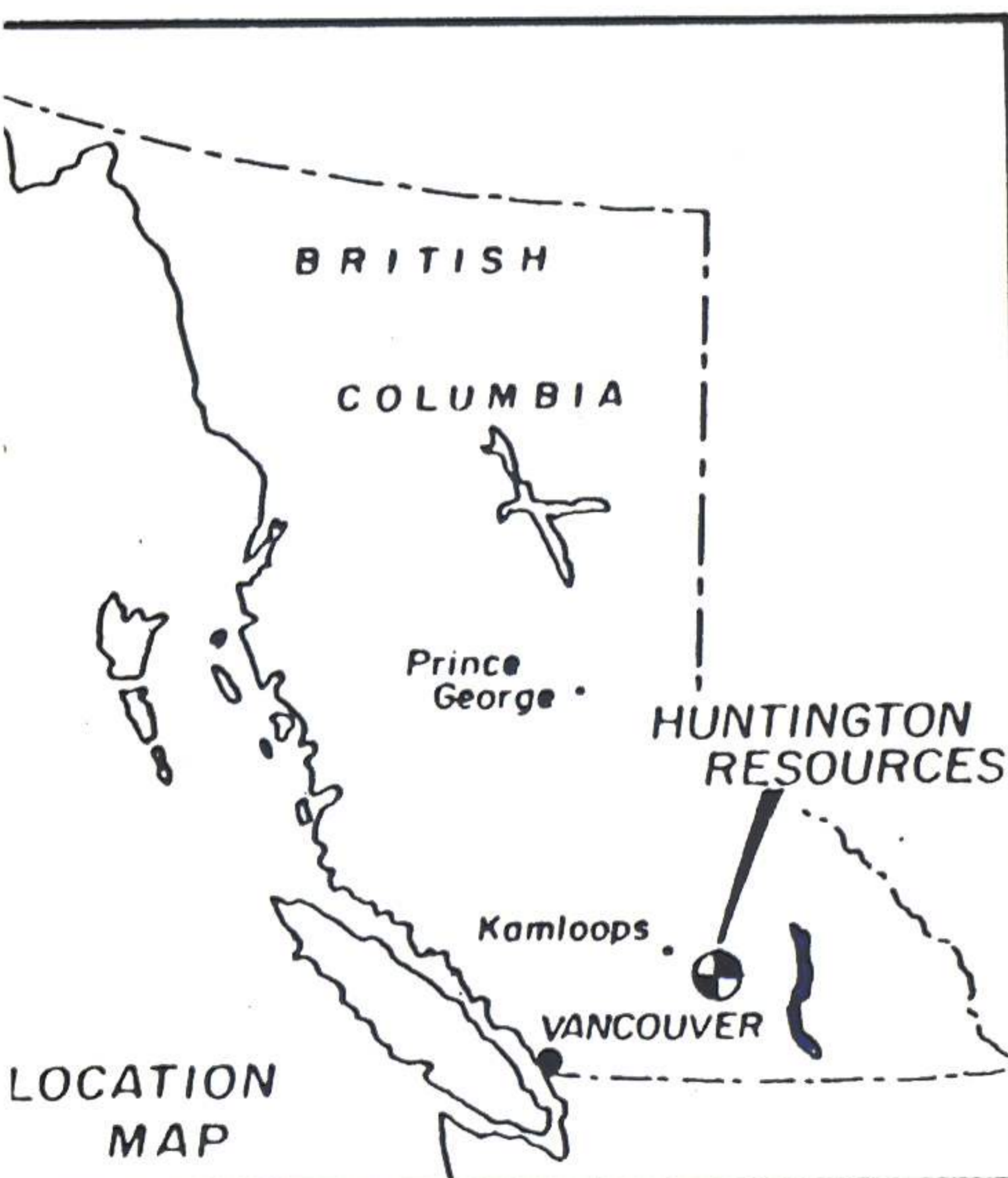
Fig. No. 4