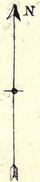
PLATE II. SURFACE GEOLOGY - MINES AREA NICKEL PLATE MT 1 inch = 600 feet