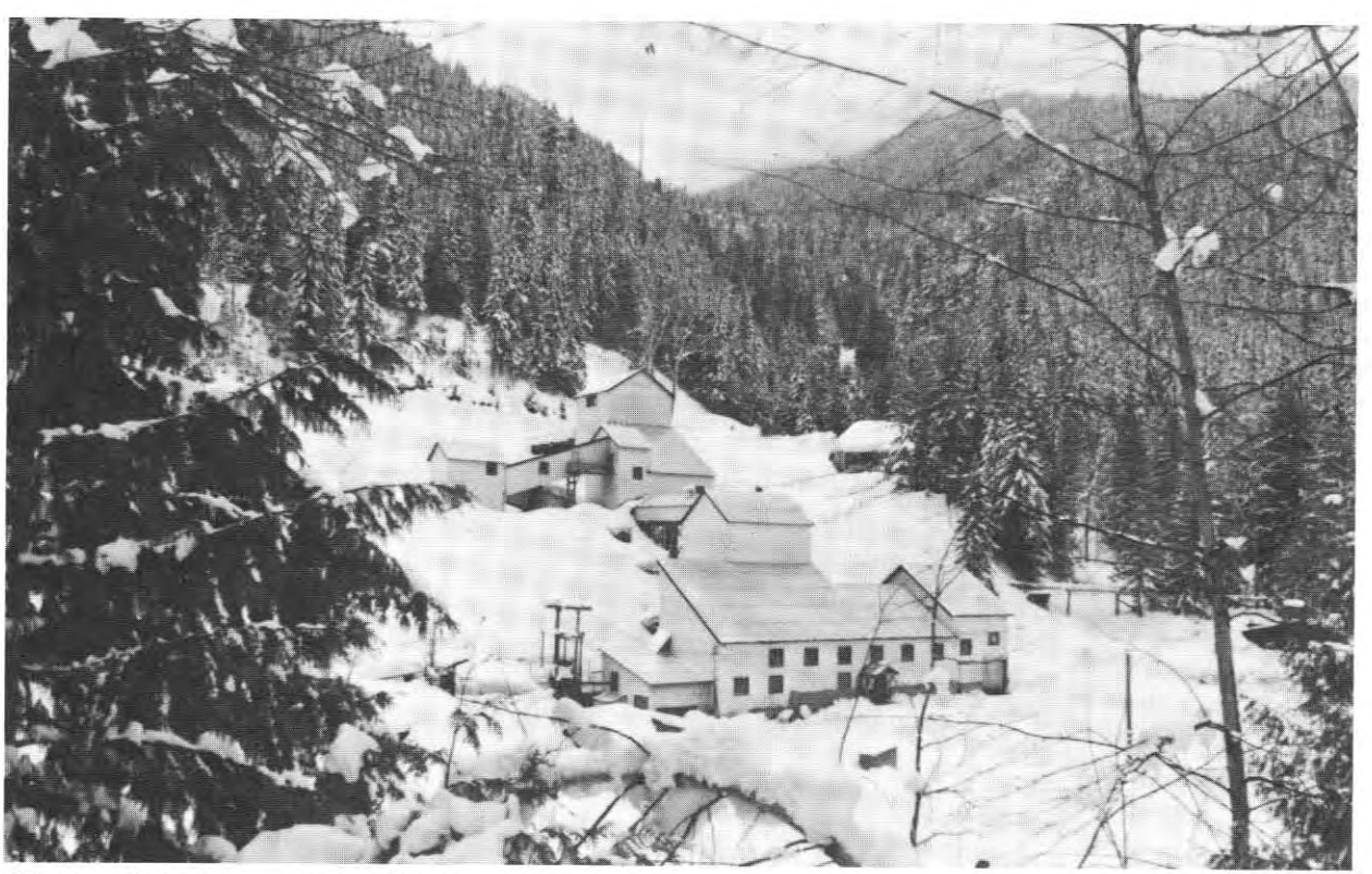
Silvana Mines Inc. - Sandon, B.C.