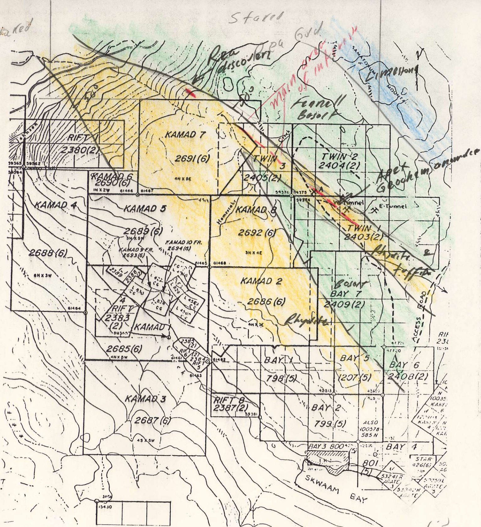
Figure 2 Claim Map and Location of Mineral Occurrences