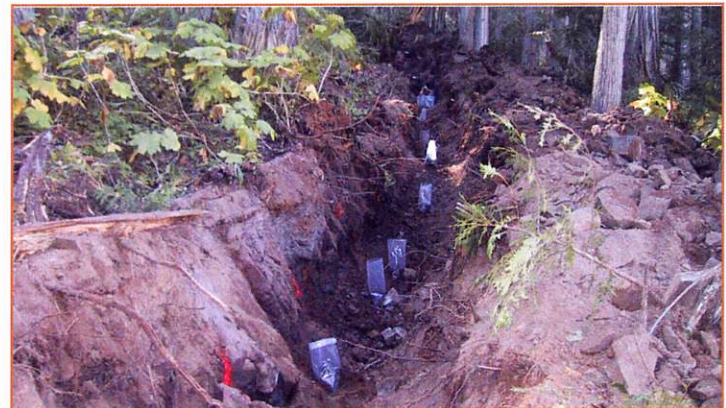
Mount Polley Northeast Zone Trenching