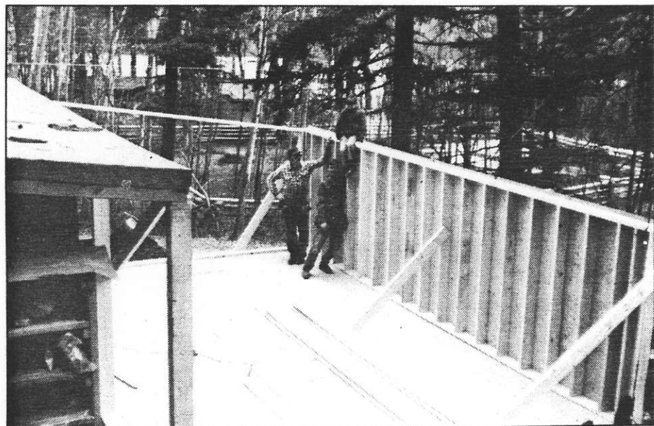
X-Cal crew at work on the addition to the company's field office in the Bridge River/Bralorne area of British Columbia. Construction is expected to be completed this month.

No changes are anticipated at the Kentucky-Tennessee Clay Co. and Colorado Aggregate Co. or the Republic, Washington, gold mine. Those operations continue to be profitable, the company said.