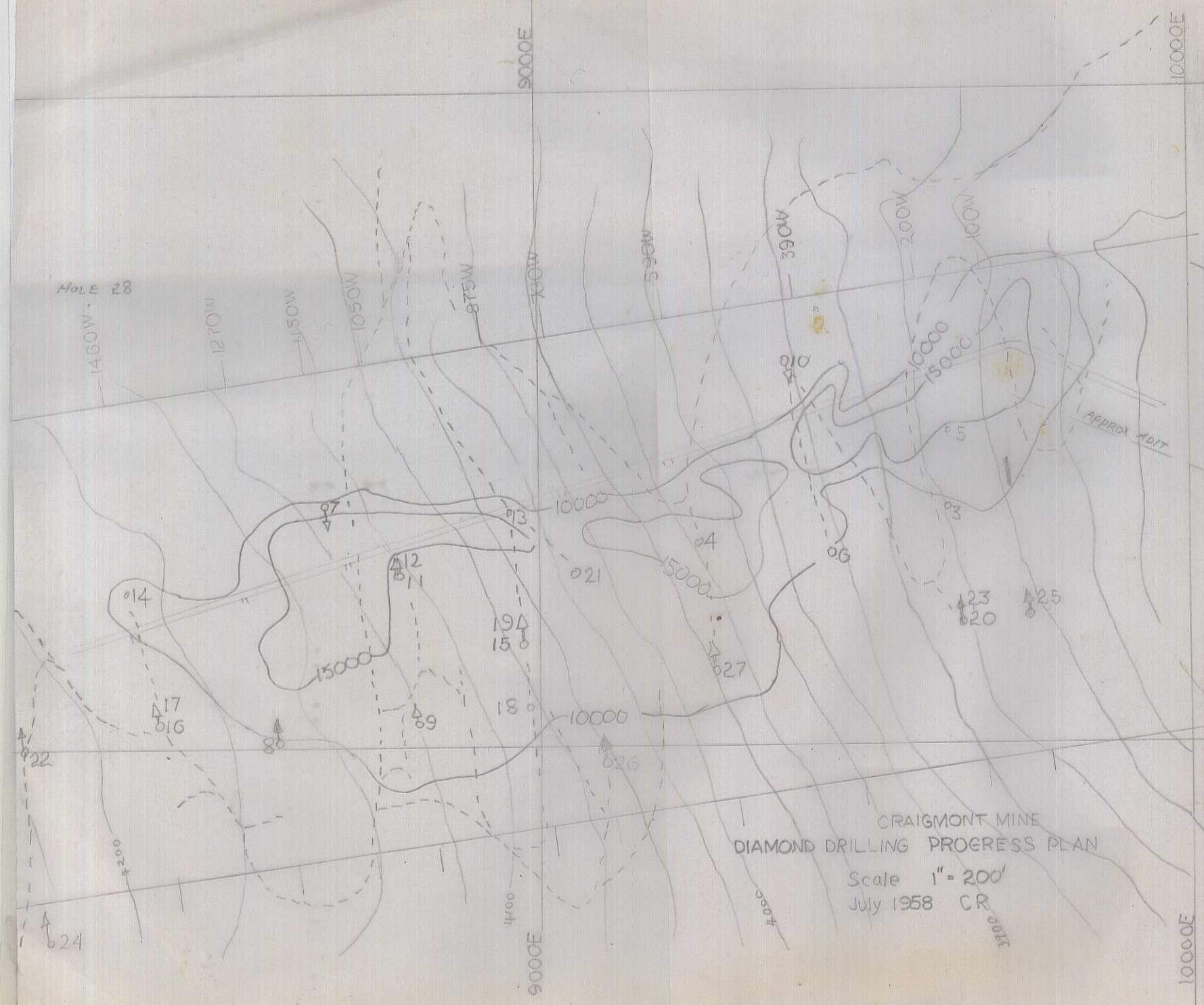
CRAIGMONT MINE DIAMOND DRILLING PROGRESS PLAN Scale 1" = 200' July 1958 CR