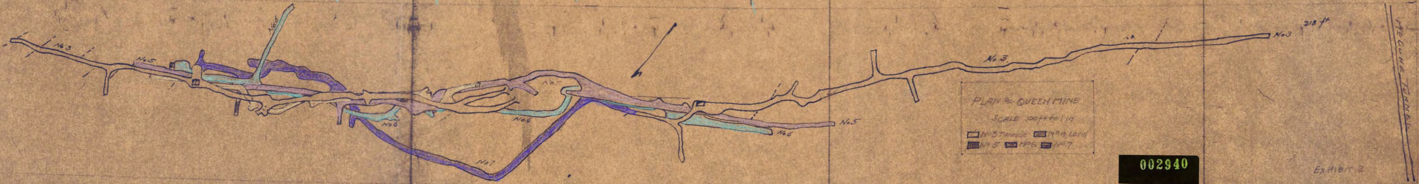
PLAN OF QUEEN MINE SCALE 100 ft to 1 in No 3 No 4 No 5 No 6 No 7