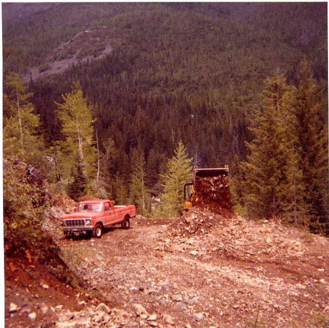
TEST PIT SITE SORTING ORE/WASTE