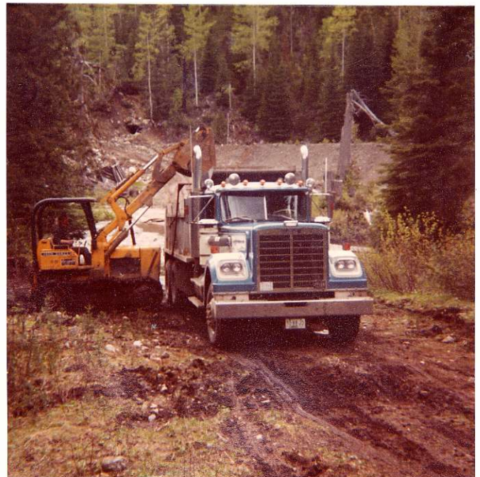
LOADING ORE SLIDE CREEK CROSSING