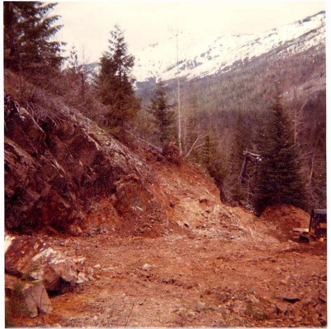
TEST PIT SITE CLEARING IN PROGRESS