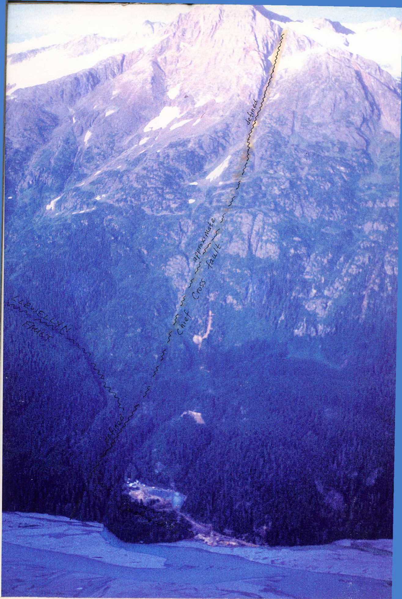
Tulsequah Chief mine workings contrast vividly with the dense vegetation of the Tulsequah River valley. This aerial view to the east shows the 5200 (river level at an elevation of 115m), 5400, 5900, 6300 and 6500 level portals. The surface trace of the Chief Cross fault is highlighted with defined and approximate sections