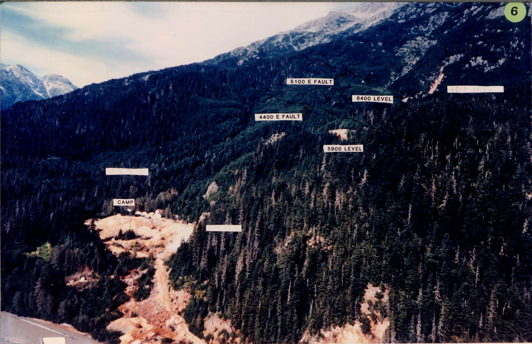
LOOKING NW OVER TULSEQUAH CHIEF