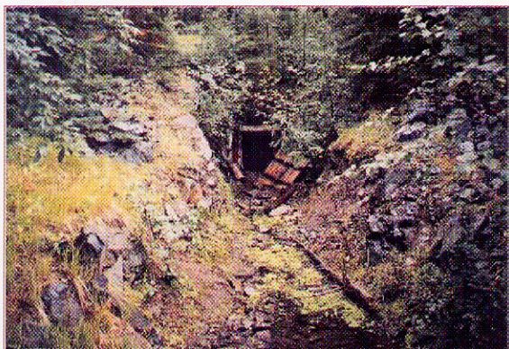
Windpass portal and drainage

The Windpass and Sweethome Gold Properties , are located 50 kms northeast of Barriere, B.C. The property consists of seven contiguous mineral leases totaling 389.34 hectares, which are valid until the year 2020. The Windpass and Sweethome are past gold producers with the Windpass producing 34,456 ounces of gold from 102,996 tons milled over a six year period from 1933-1939. As per a geological report by N. Tribe, P.Eng. (2003) eighteen additional parallel zones exist with the potential for deposits similar to the Windpass and Sweethome.