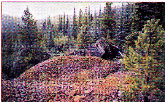
Sweethome dump and decaying wooden structure (tram)

The Windpass and Sweethome Gold Properties , are located 50 kms northeast of Barriere, B.C. The property consists of seven contiguous mineral leases totaling 389.34 hectares, which are valid until the year 2020. The Windpass and Sweethome are past gold producers with the Windpass producing 34,456 ounces of gold from 102,996 tons milled over a six year period from 1933-1939. As per a geological report by N. Tribe, P.Eng. (2003) eighteen additional parallel zones exist with the potential for deposits similar to the Windpass and Sweethome.