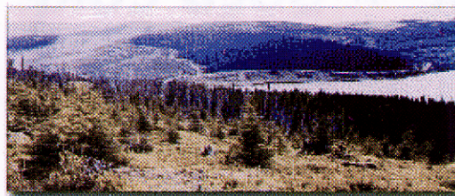
Dobbin - Platinum/Palladium/Copper Property

The Dobbin I Property is located 27 kms northwest of Kelowna, British Columbia and adjacent to and east of the Flap Gold Property, contains a quartz stockwork that is at least 1,000 x 1,500 metres (3,300' x 5,000' feet). The Dobbin II Property located 1,500 metres S.E. of the main Moly Dobbin Showing , is the Dobbin Copper Showing. Rocks of the ultra basic suite are the main host of the coppery magnetite mineralization and are wide spread over the property. Significant to this showing is the association of platinum/palladium. Drill results returned .56% Cu and 2.4 g/t Pt/Pd over 15 metres.