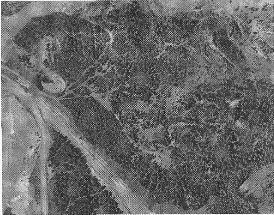
Millzone Collars utilizing previously cut access in the mid 90's while the mine was in operation.