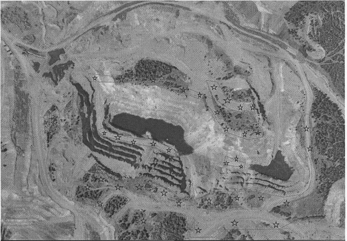
Pit 2 Collar locations. All collars are in and around the pit designed to be drilled from existing mine roads.