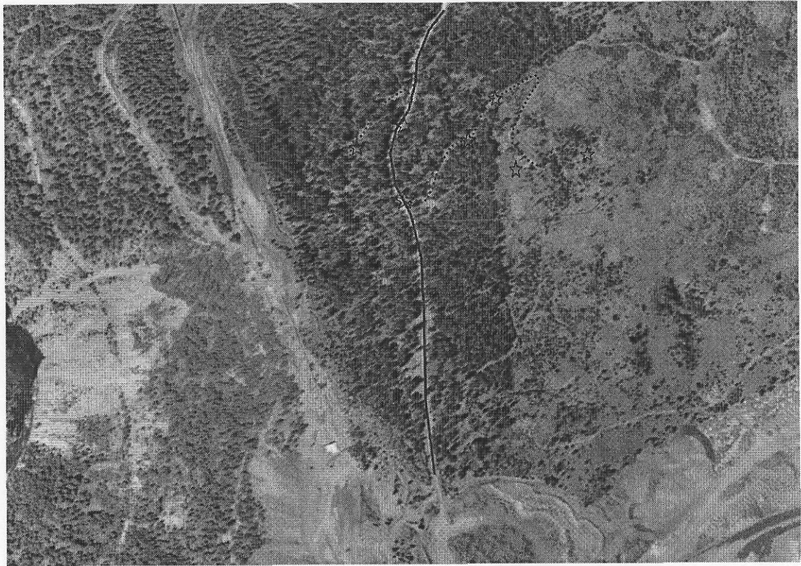
Oronoco Zone collars utilizing main road to conveyor suspension bridge and tailings dam as well as previously cleared access from drilling that took place in the mid 90's.