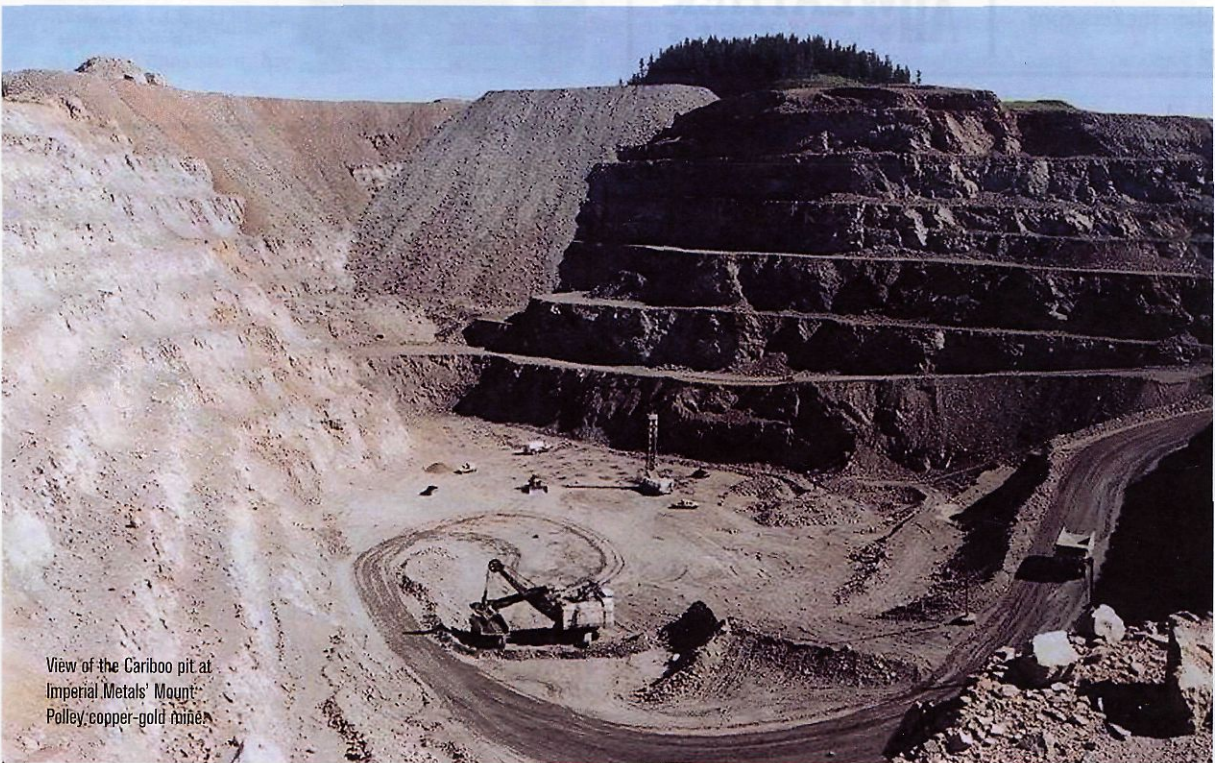
View of the Cariboo pit at Imperial Metals' Mount Polley copper-gold mine.

ONE OF THE OLDEST AND MOST OFT-REPEATED PHRASES IN MINING LORE ADVISES: "IF YOU WANT TO FIND A DEPOSIT, LOOK ON THE ground where one has already been found." True to that sentiment, the exploration team at Imperial Minerals Corporation (III-TSE) has discovered a unique, high-grade copper-gold deposit two kilometres southwest of a known deposit on the company's 100 per cent-owned Mount Polley property. This discovery, in conjunction with the rise in copper prices, has infused the copper exploration sector with vitality. B.C.'s famous copper-gold porphyry rich resources are once again drawing attention.