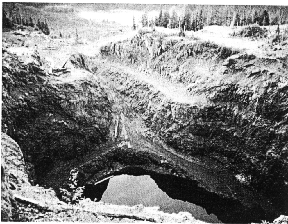
The Merry Widow magnetite pit; the drill is delineating gold-copper skarns.