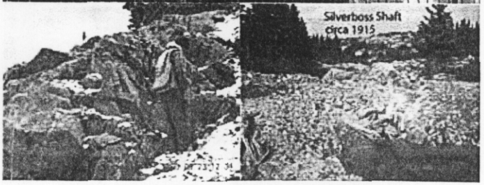
Silverboss 2005: Molybdenum, Gold-Silver