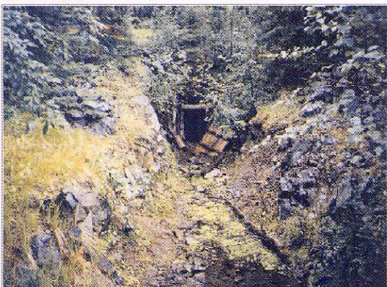
Windpass portal and drainage

The Windpass and Sweethome Gold Properties , are located 50 kms northeast of Barriere, B.C. The property consists of seven contiguous mineral leases totaling 389.34 hectares, which are valid until the year 2020. The Windpass and Sweethome are past gold producers with the Windpass producing 34,456 ounces of gold from 102,996 tons milled over a six year period from 1933-1939. As per a geological report by N. Tribe, P.Eng. (2003) eighteen additional parallel zones exist with the potential for deposits similar to the Windpass and Sweethome.