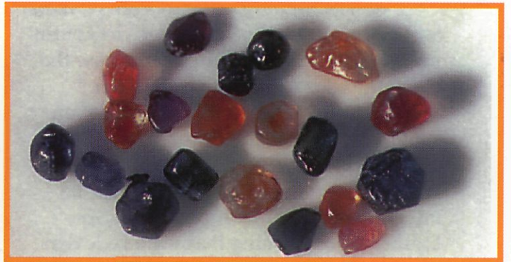
Heat Treated Sapphires