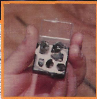
Uncut Rough Sapphires From Property