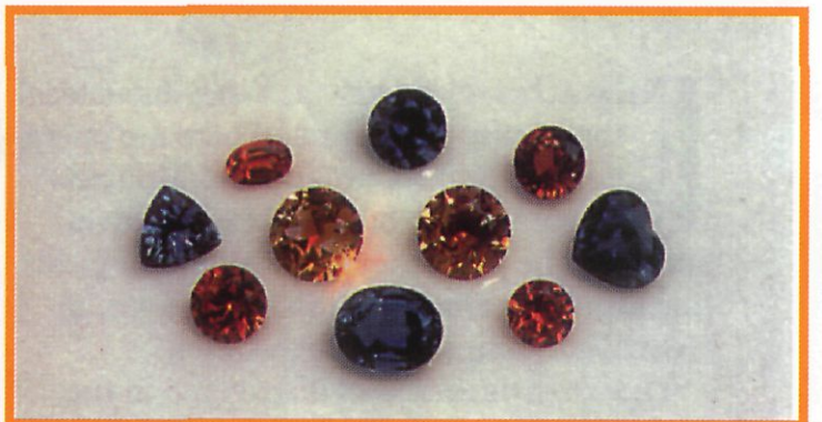
Finished Sapphire Gemstones