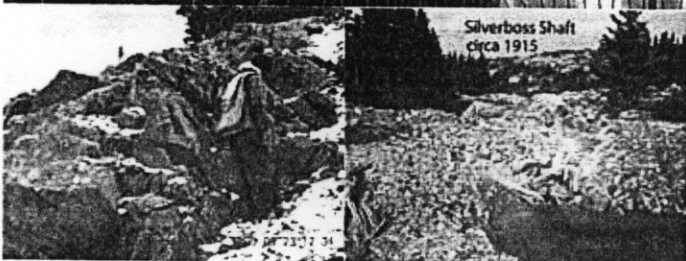
Silverboss 2005: Molybdenum, Gold-Silver