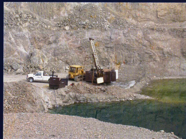
Drilling at the Crescent Pit