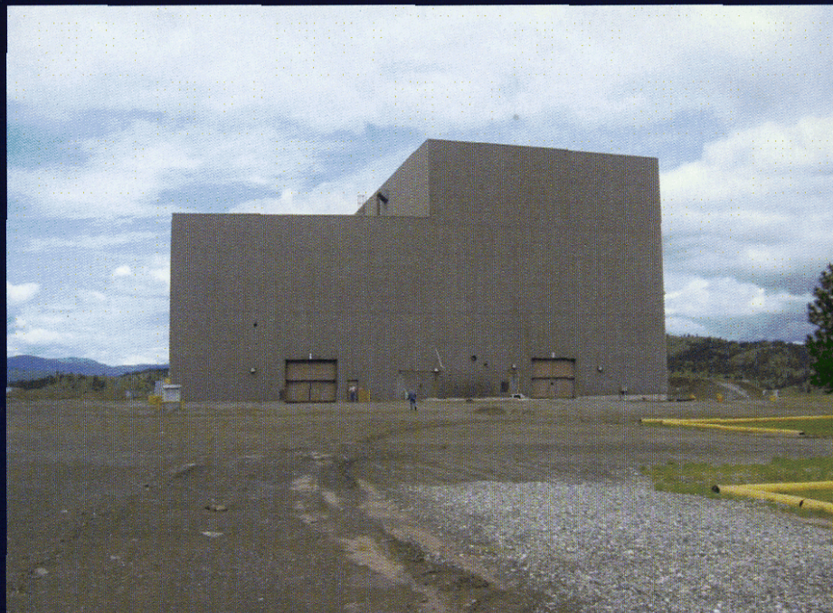
Afton Mill Infrastructure