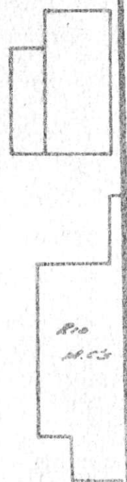
SKETCH OF CLAIMS in the MISSISSAUGA LAKE AREA 1" = 6000'