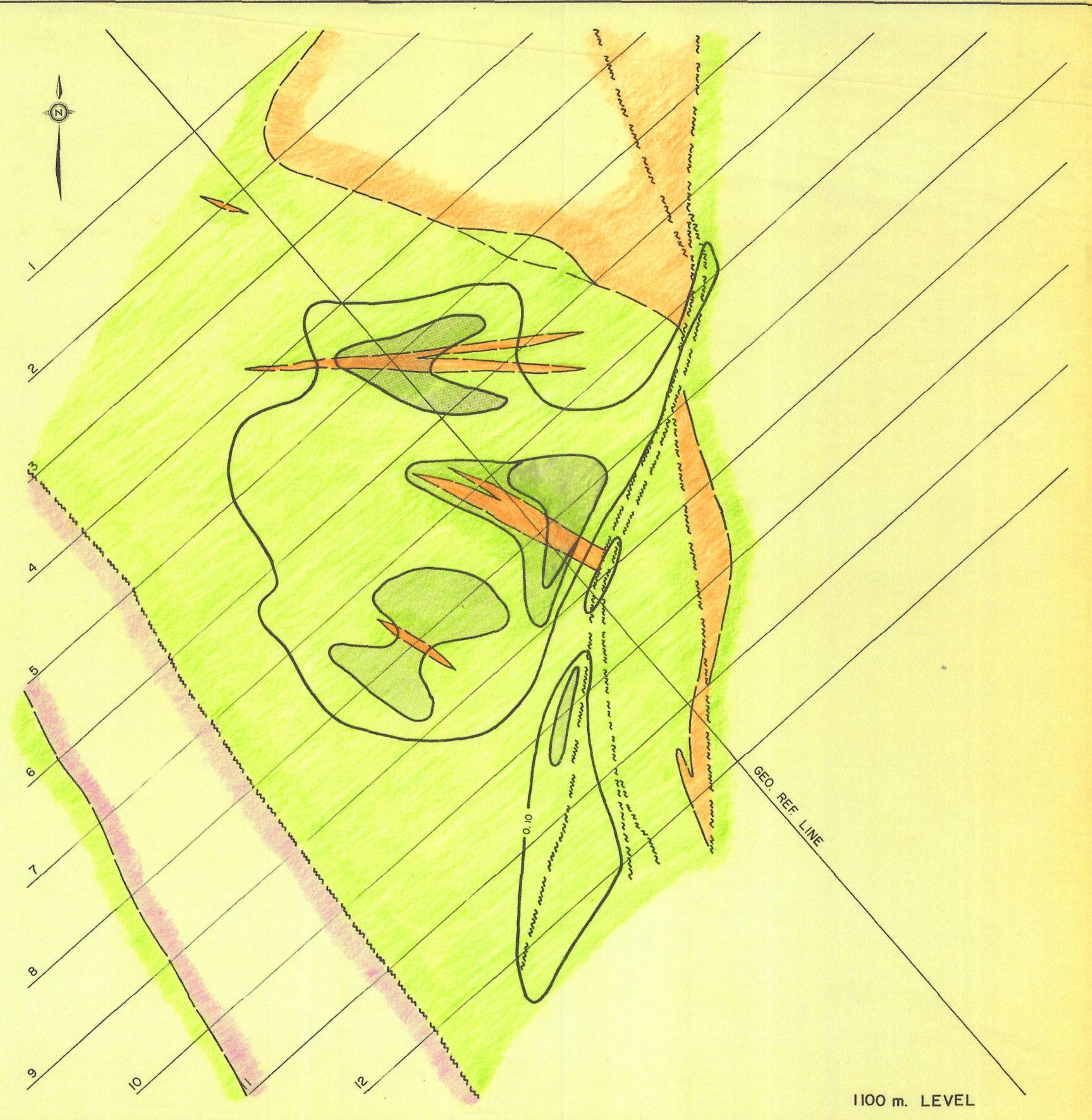
1100 m. LEVEL