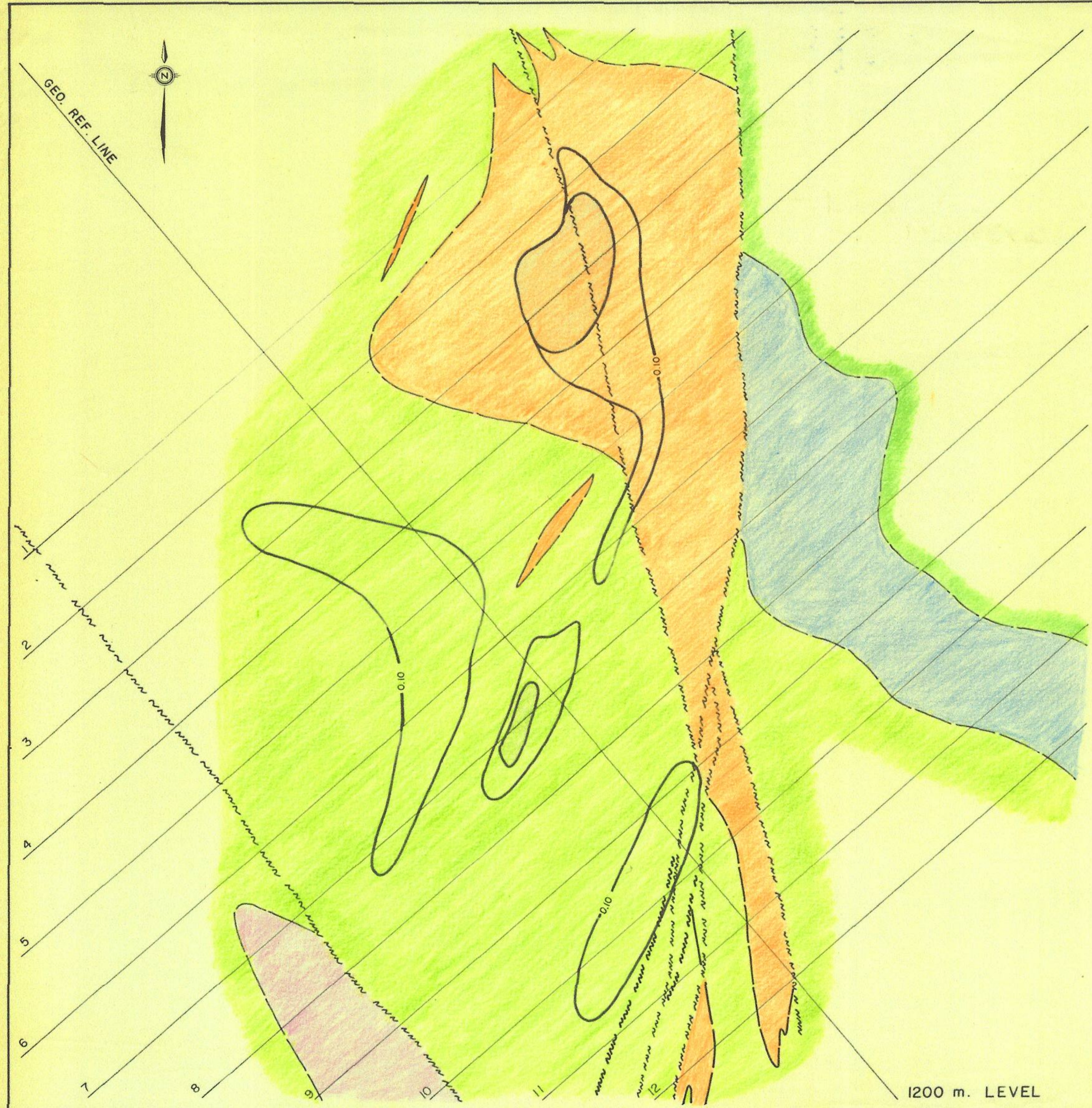
1200 m. LEVEL