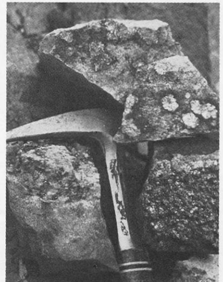
The search pays off with molybdenum mineralization clearly visible in these samples from the N zone