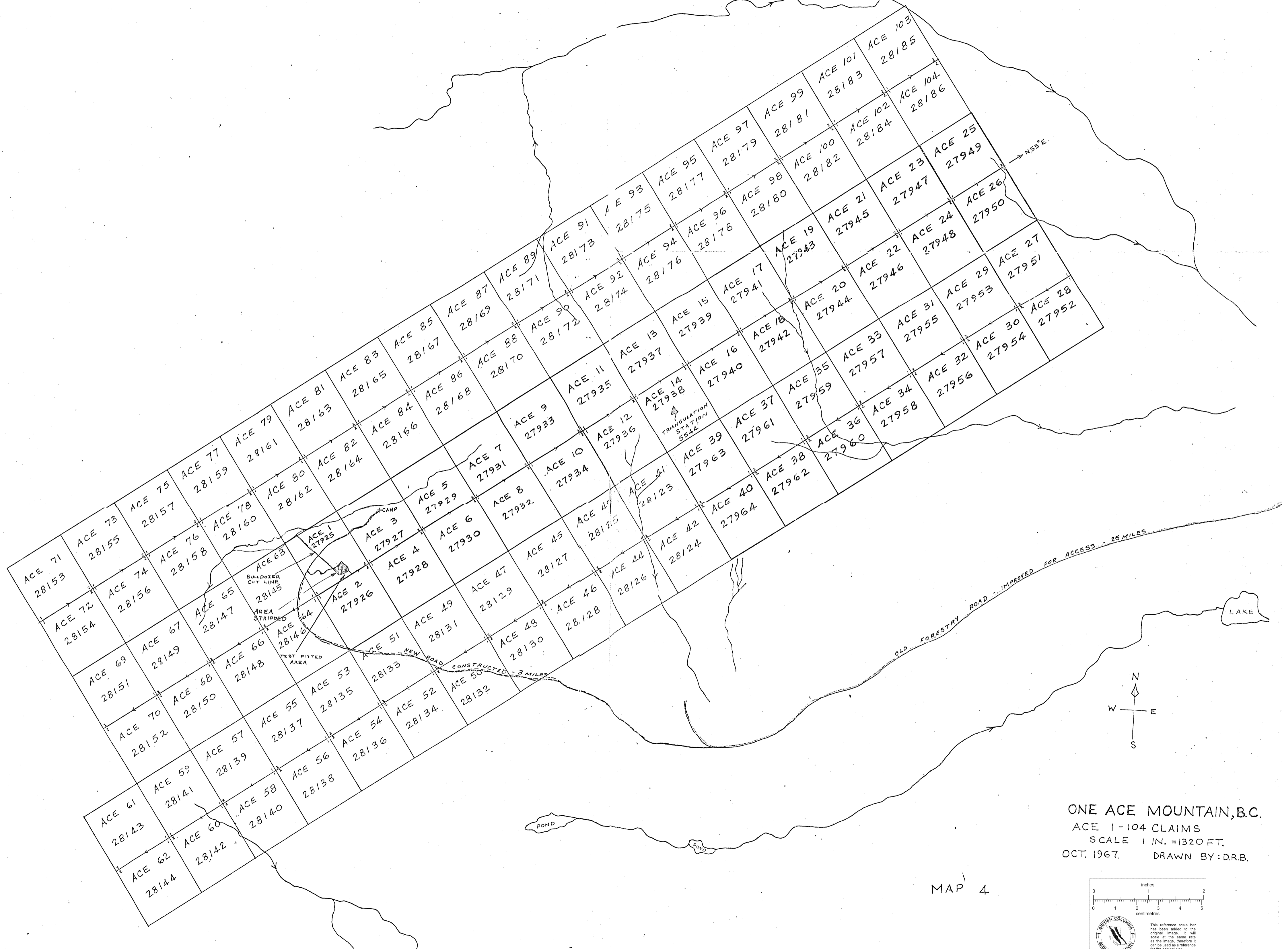
ONE ACE MOUNTAIN, B.C. ACE 1-104 CLAIMS SCALE 1 IN. = 1320 FT. OCT. 1967. DRAWN BY: D.R.B.