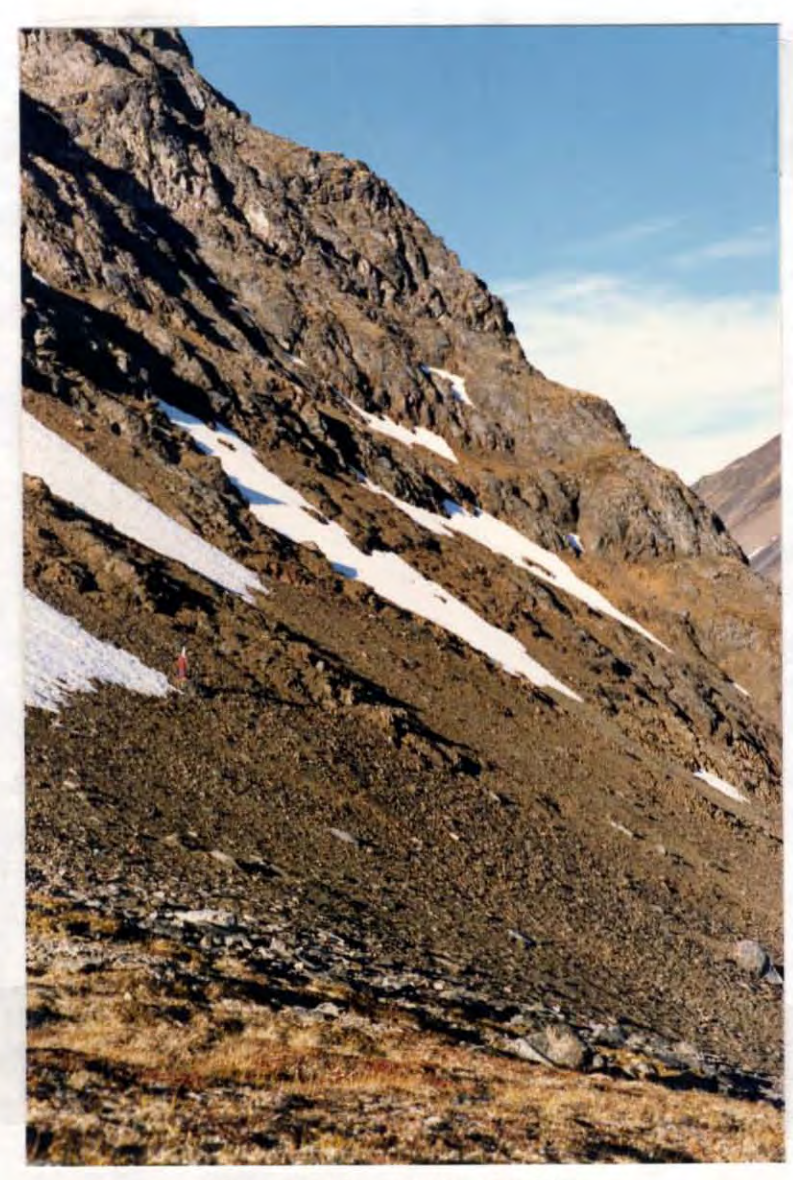
south mountain, northwest side, shows the massive volcanics