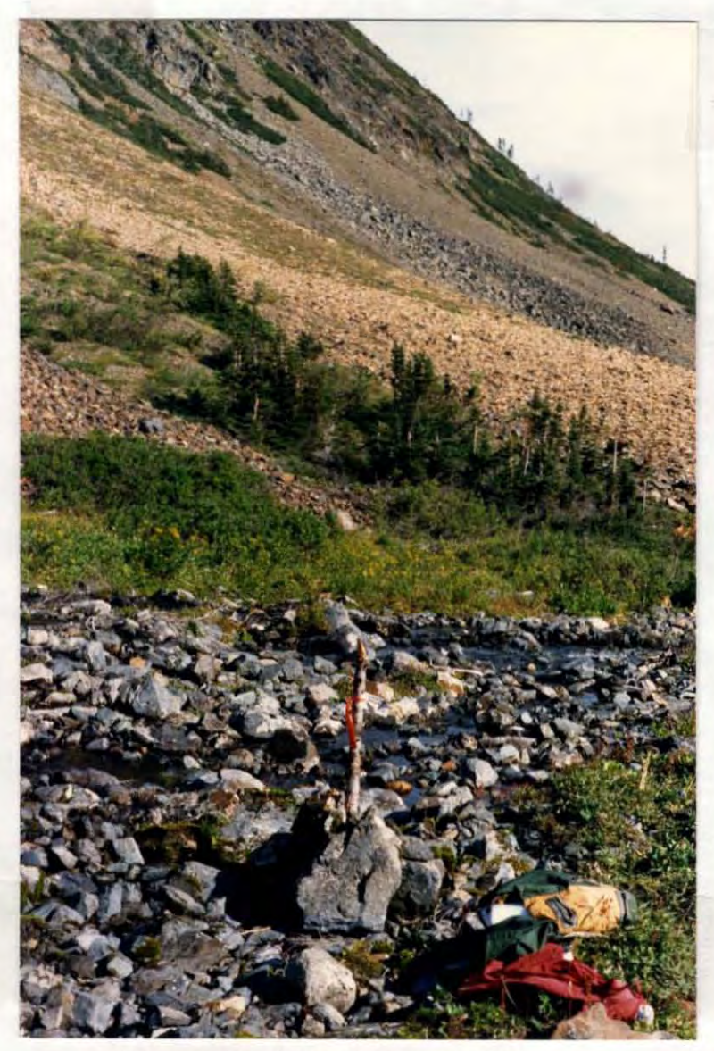
I.D. post 1 S, in creek between the middle ridge and the south mountain.