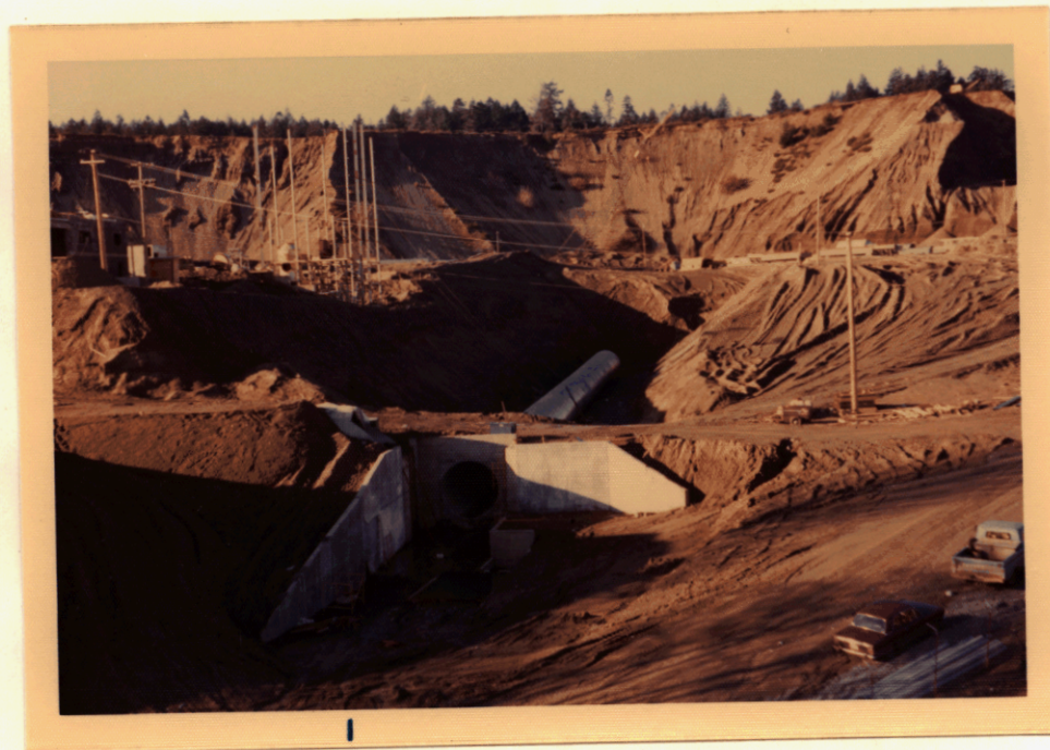
D-12 Dec. 30/74 Work on shore by others