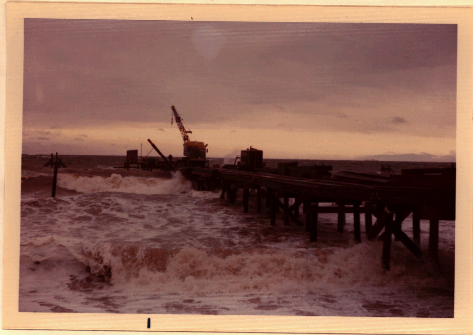
D-1 Dec. 12/74 Wave Action at the new Trestle