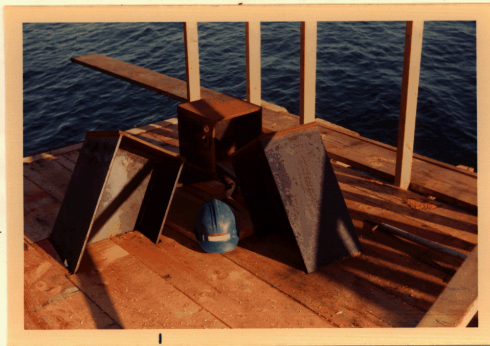
D-19 Dec.30/74 Pile group at Bent #24-D