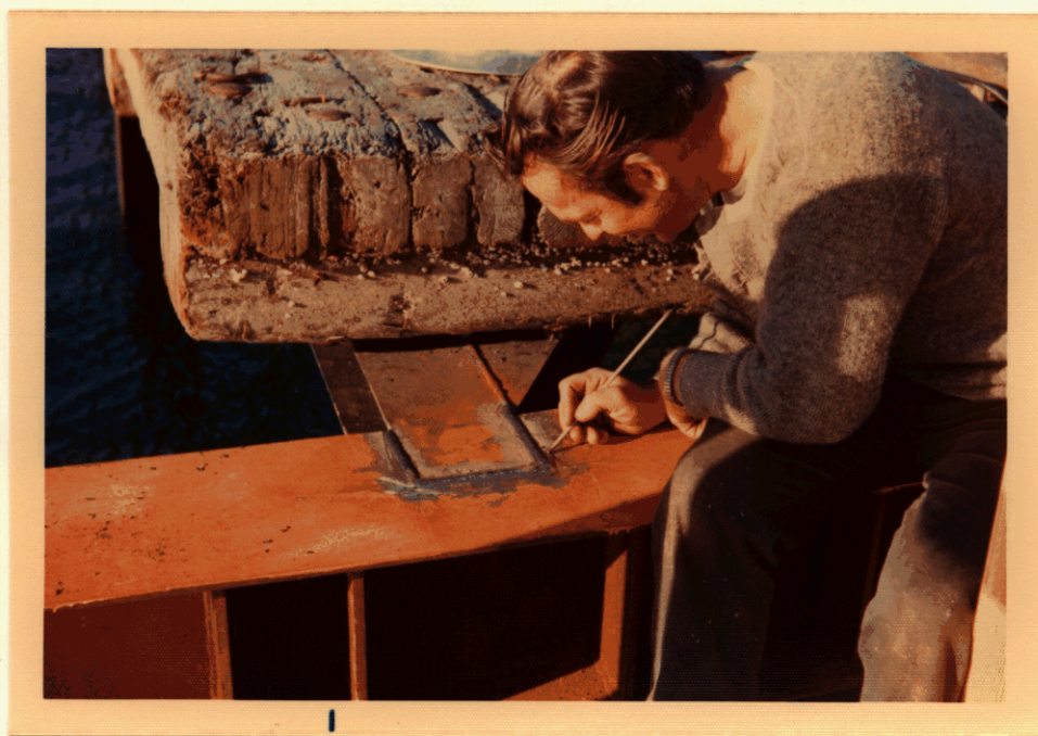
D-17 Dec.30/74 Weld repair at Bent #22-A