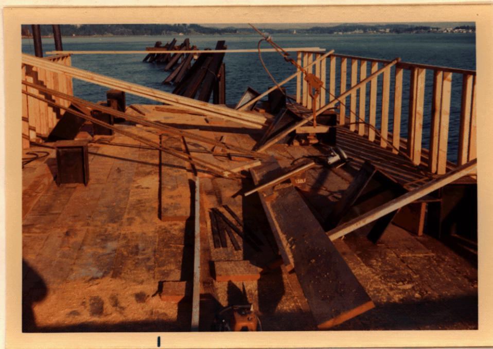
D-18 Dec.30/74 Wharfhead dolphin floor of form is completed