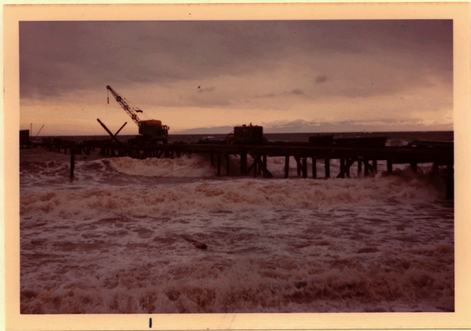
D-2 Dec. 12/74 Wave action at the new Trestle