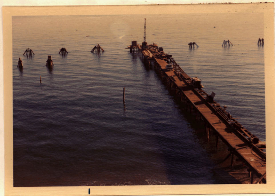
D-9 Dec. 30/74 General view of project taken from top of existing washplant