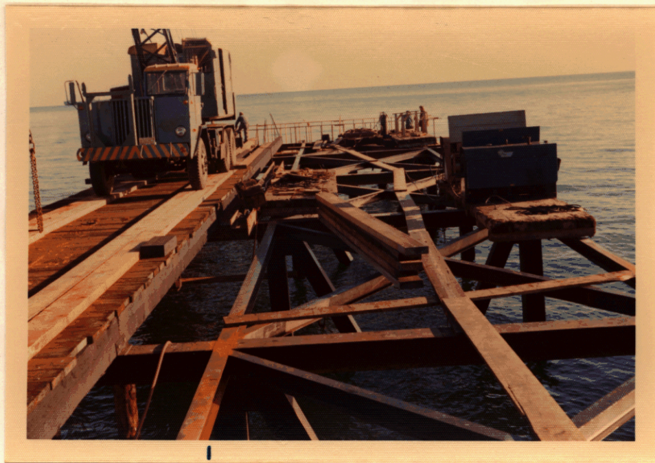
D-16 Dec.30/74 Wharfhead area stringers are placed to Bent #22