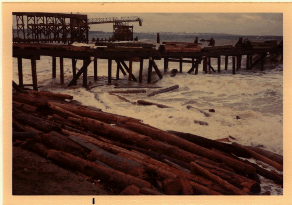
D-5 Dec.12/74 Drift logs piling up at the new Trestle