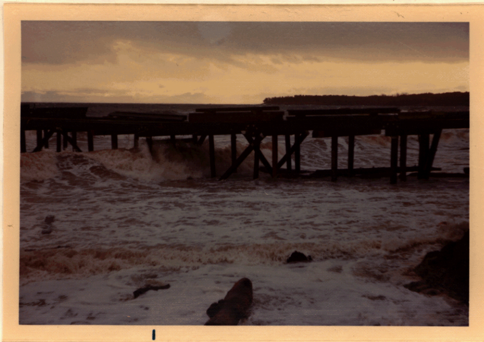
D-3 Dec.12/74 Wave action at the new Trestle