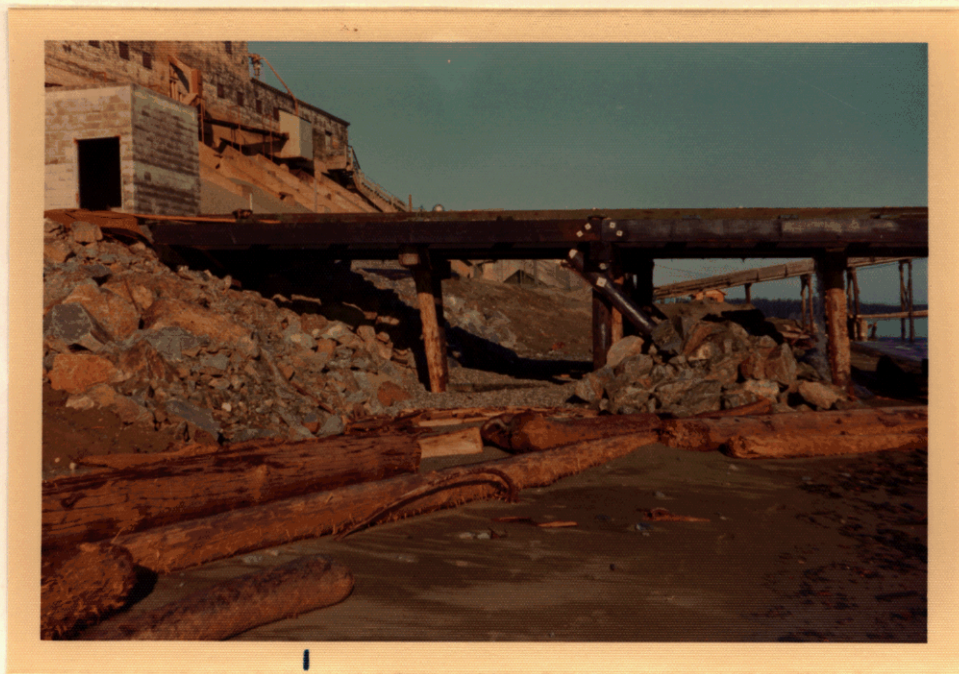
D-14 Dec. 30/74 Rip-rap placed Bent #1 and #2