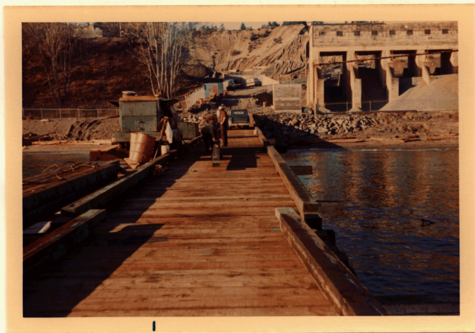
D-15 Dec. 30/74 Installing guard rail on Access Trestle