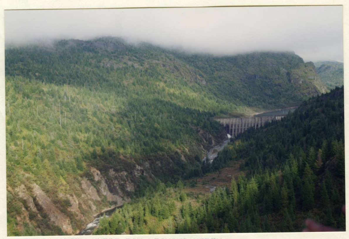
ANYOX CREEK HYDRO DAM LOOKING NORTH.