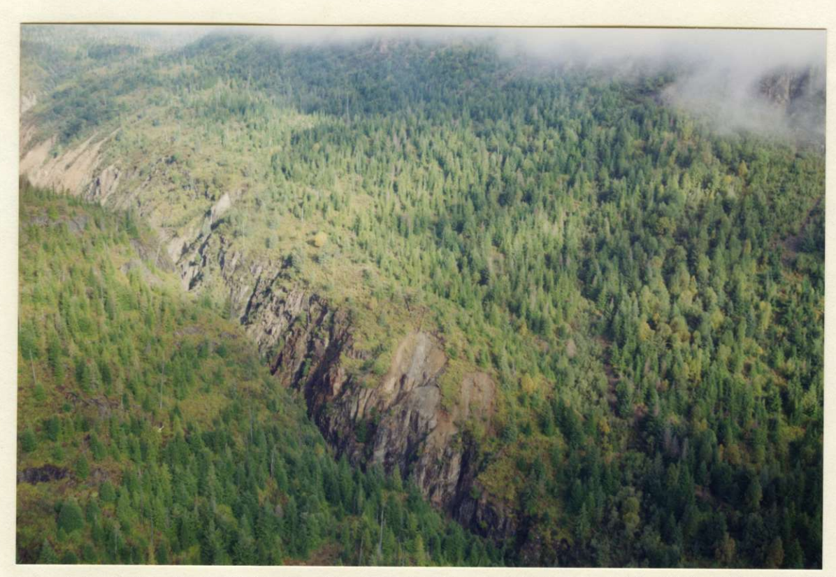
THE BONANZA DEPOSIT ON BONANZA CK. PRODUCED 647,000 TONNES OF 2.1% Cu AND HAS RESERVES OF 10,624 TONNES OF 1.76% Cu, 0.16 g/t Au, 13.7 g/t Ag.