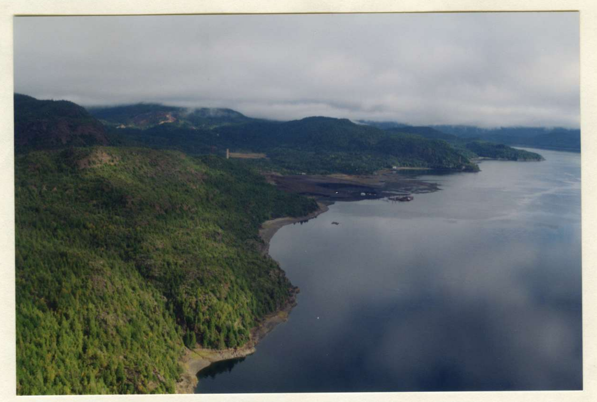
ANYOX TOWNSITE HARBOUR SHOWING HIDDEN CREEK DREBODY UPPER LEFT, REMAINS OF OLD SMELTER AT SMOKESTACK