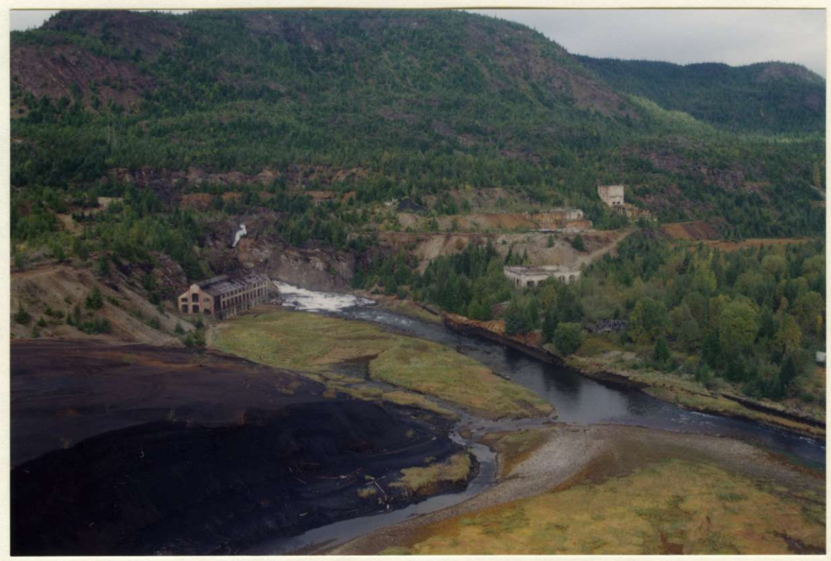
ANYOX TOWNSITE AT THE MOUTH OF ANYOX CREEK. BLACK TAILINGS LOWER LEFT CONSIST OF 85-95% SILICA WHICH IS RECLAIMED FOR ABRASIVES.