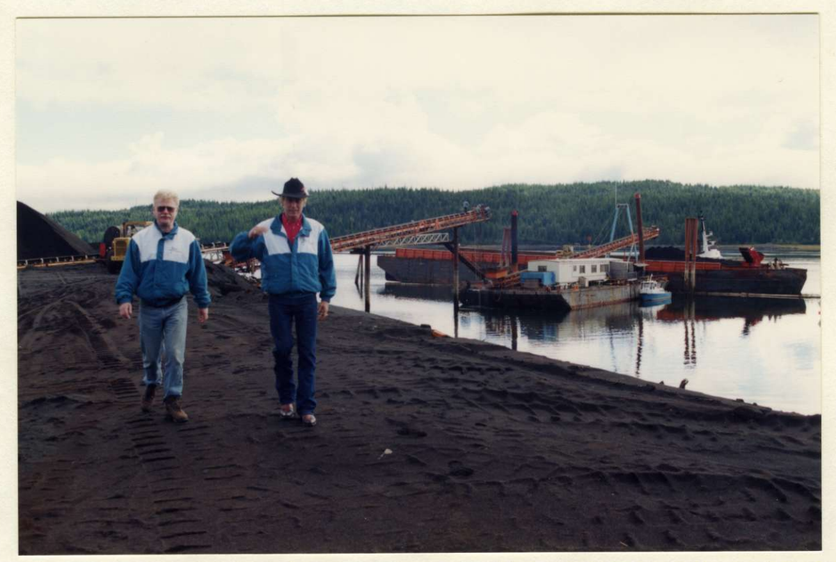
SHIPMENTS OF BLACK SILICA SAND LOADED FOR VANCOUVER. SHIPMENTS ARE SENT 3 TIMES EACH MONTH BY TRU-GRIT ABRASIVES INC.