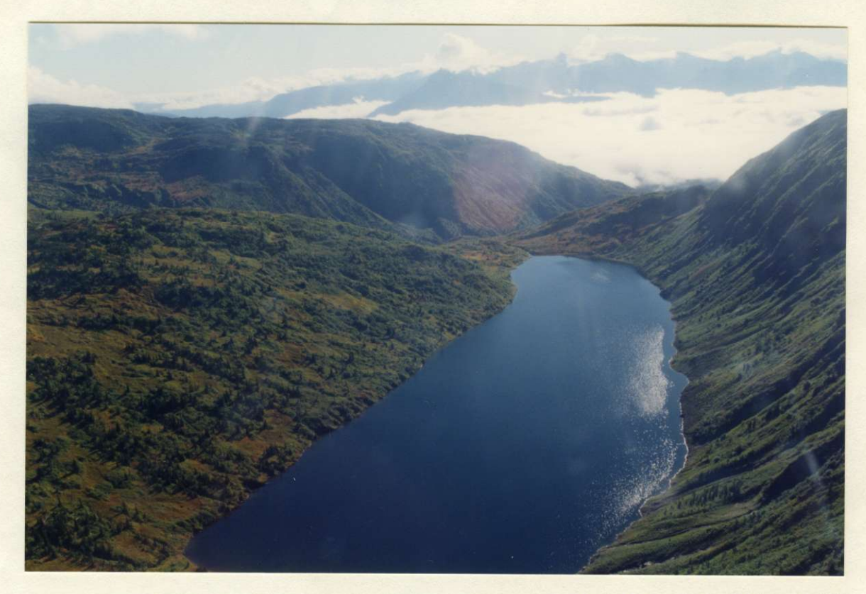
BONANZA LAKE LOCKING SOUTHEAST TOWARDS ANYOX AND GRANBY BAY.