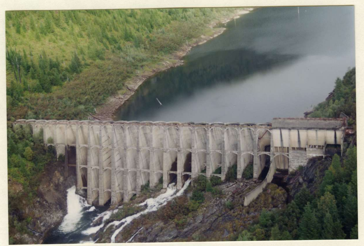
ANYOX CREEK HYDRO DAM HAS SEVERAL FAILED LOWER SECTIONS. A COST-BENEFIT ANALYSIS RECOMMENDS THAT THE SITE BE REFURBISHED.