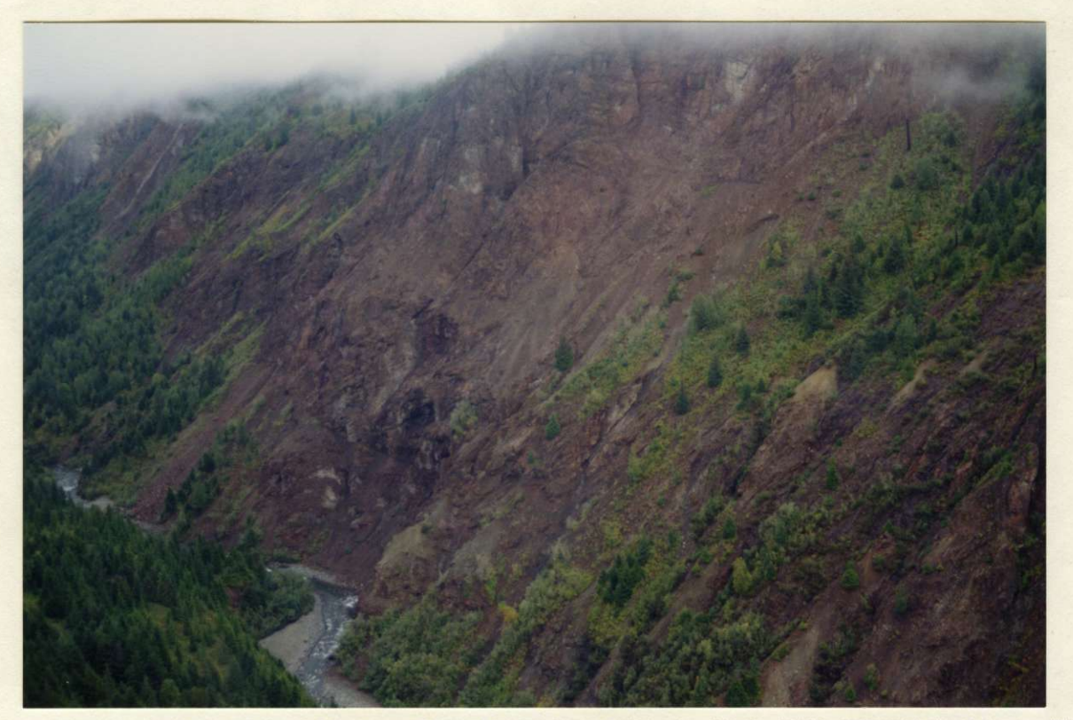
THE DOUBLE ED DEPOSIT AT ANYOX PRODUCED 1,229,235 TONNES OF 1.3% Cu, 0.6% Zn