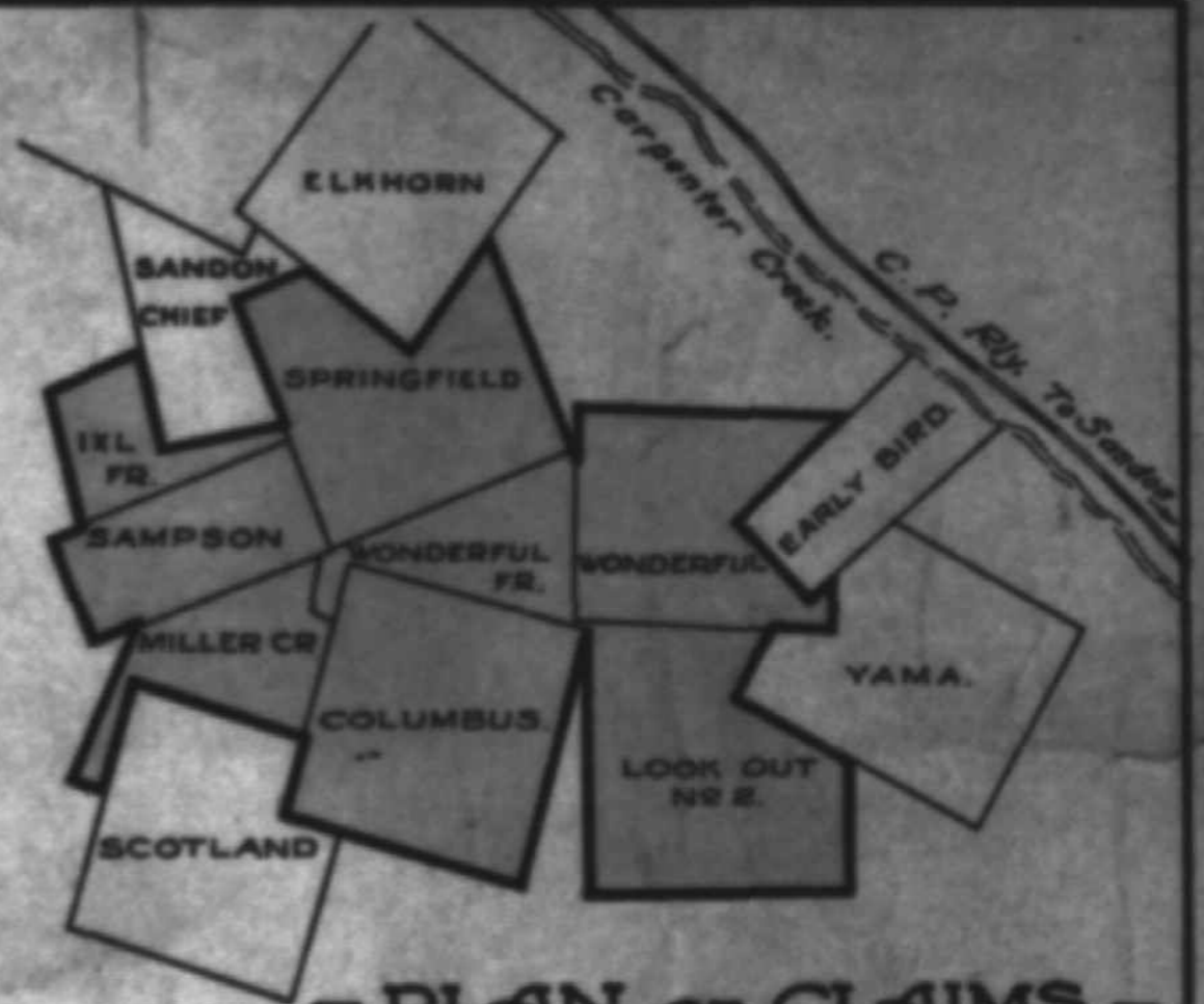
- PLAN of CLAIMS - - Scale: 1500 ft. = 1 inch. -

- WONDERFUL MINE - - SLOCAN MINING DISTRICT - - BRITISH COLUMBIA -