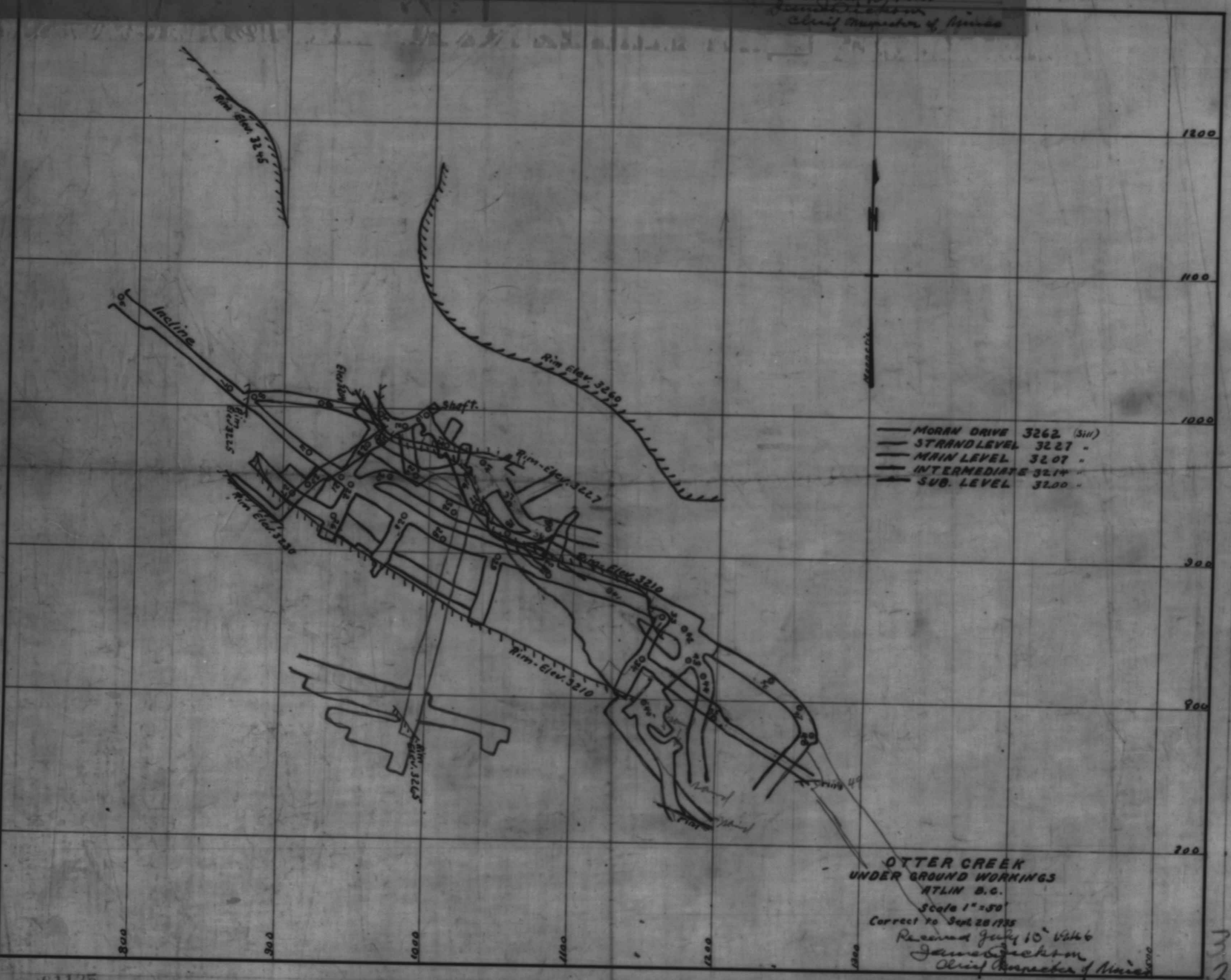
OTTER CREEK UNDER GROUND WORKINGS ATLIN B.C. Scale 1" = 50'