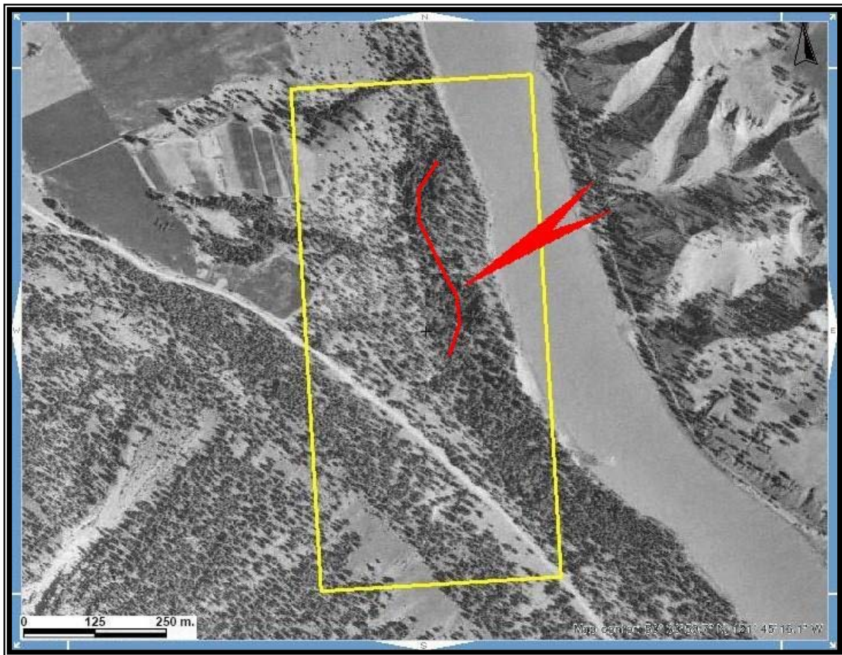
Scale 1:6,000 Map 092I Excerpt Tenure Coordinate Reference 121° 45' 16.1" W Longitude – 50° 30' 59.7" N Latitude