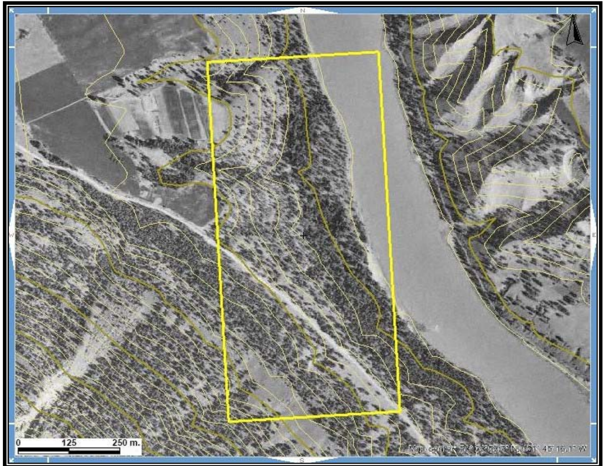
Scale 1:6,000 Map 092I Excerpt Tenure Coordinate Reference 121° 45' 16.1" W Longitude – 50° 30' 59.7" N Latitude