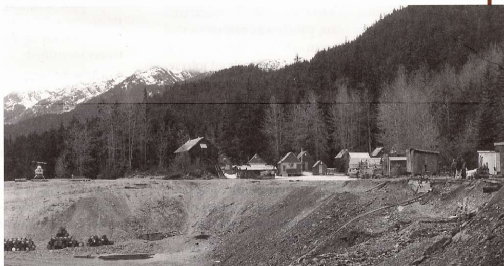
The Tulsequah Chief Mine will breath life back into a mining operation, halted by economics in the mid-50s. In addition to much needed economic prosperity to the area, the mine revitalization will also bring modern reclamation practices to the site.