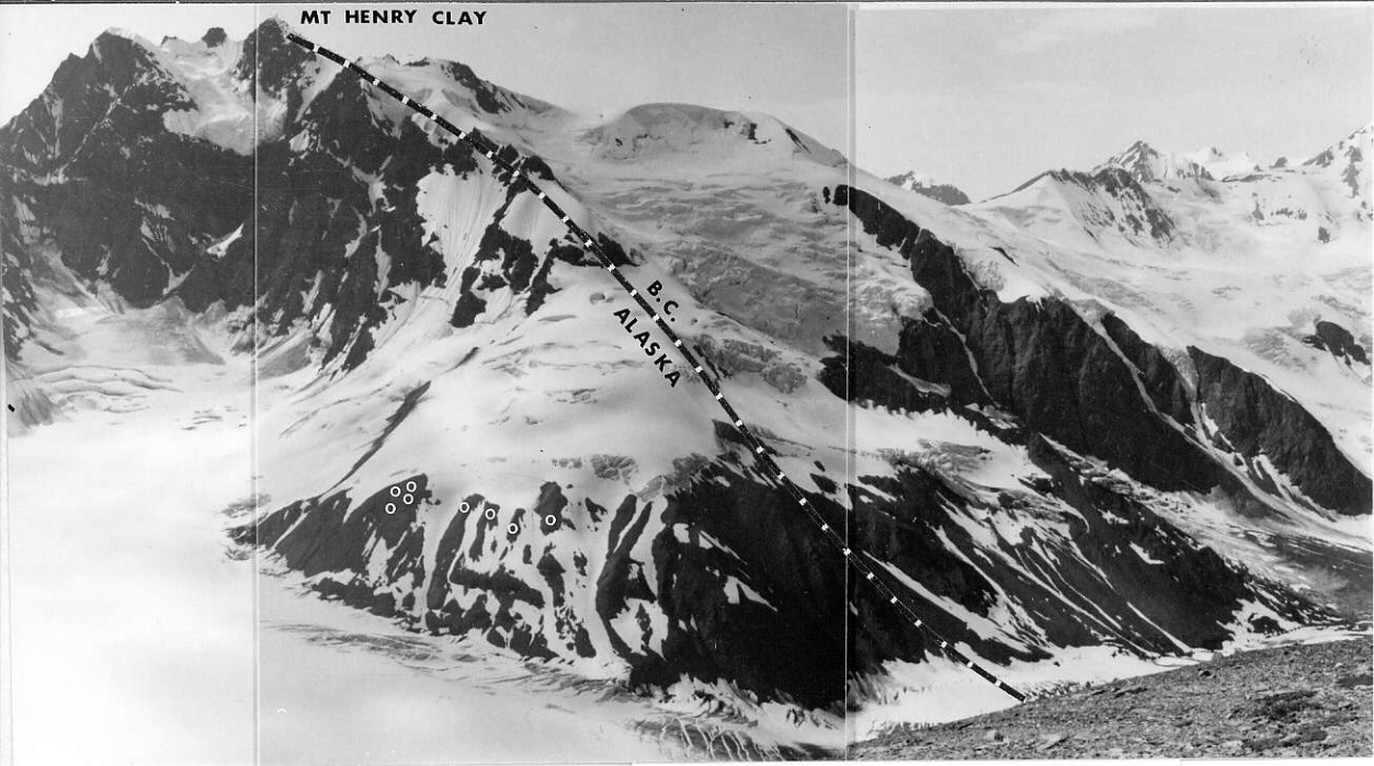
PLATE XI Pg. 377