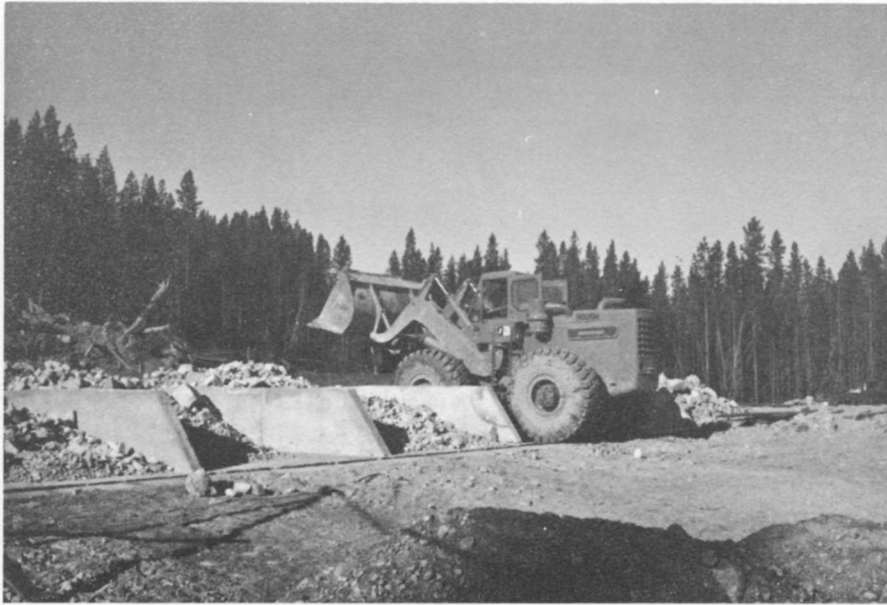
Loader dumping underground ore into Bins. Each bin represents one round.