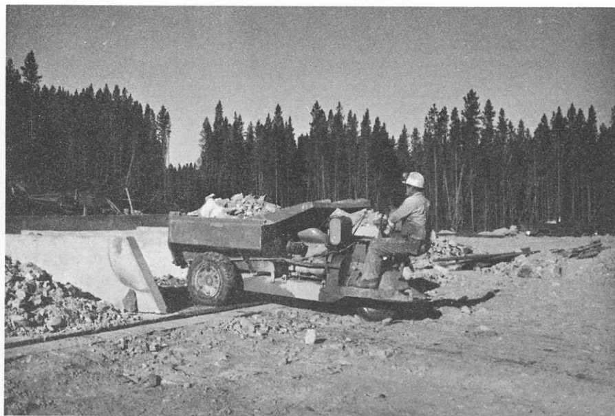
Scootcrete dumping ore from Underground.