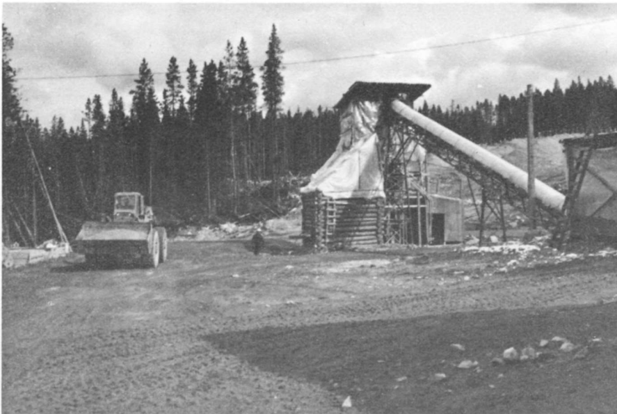
Sampling Tower and Crusher for Underground Bulk Sampling.