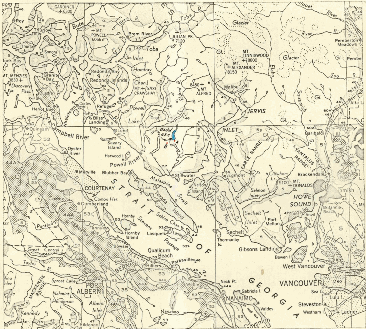
Fig. 1. Location Map of Dodd Lake, Bruce Showing (A), And Mary V Showing (B).