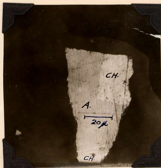
Plate II - Mag. 648

The loellingite-safflorite inclusions show the boundaries of calcite. The dark blobs of material are siliceous gangue.