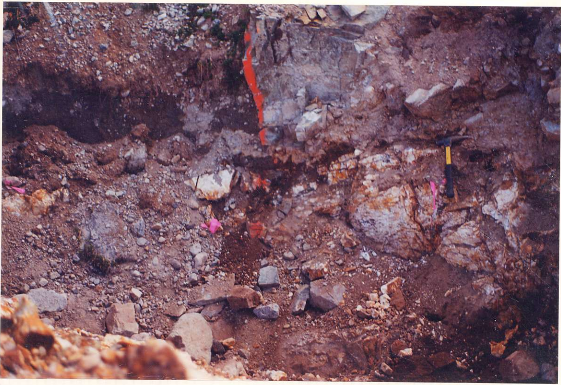
site 3 vein B