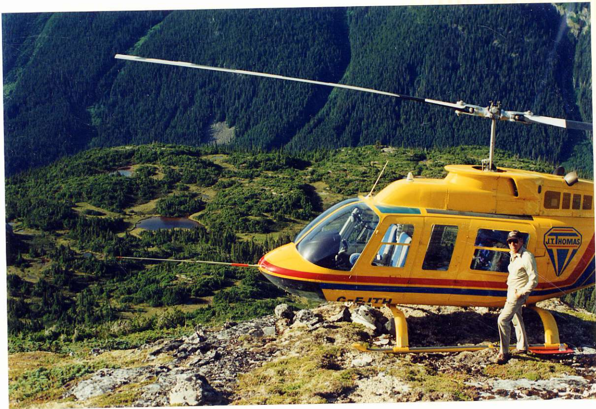
LOCATION of PREVIOUS CAMP SITE