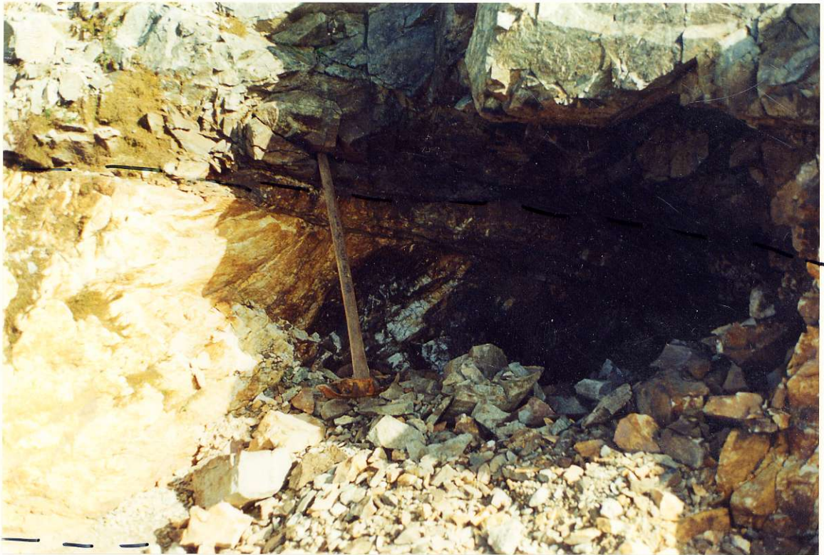
site 10 veinB