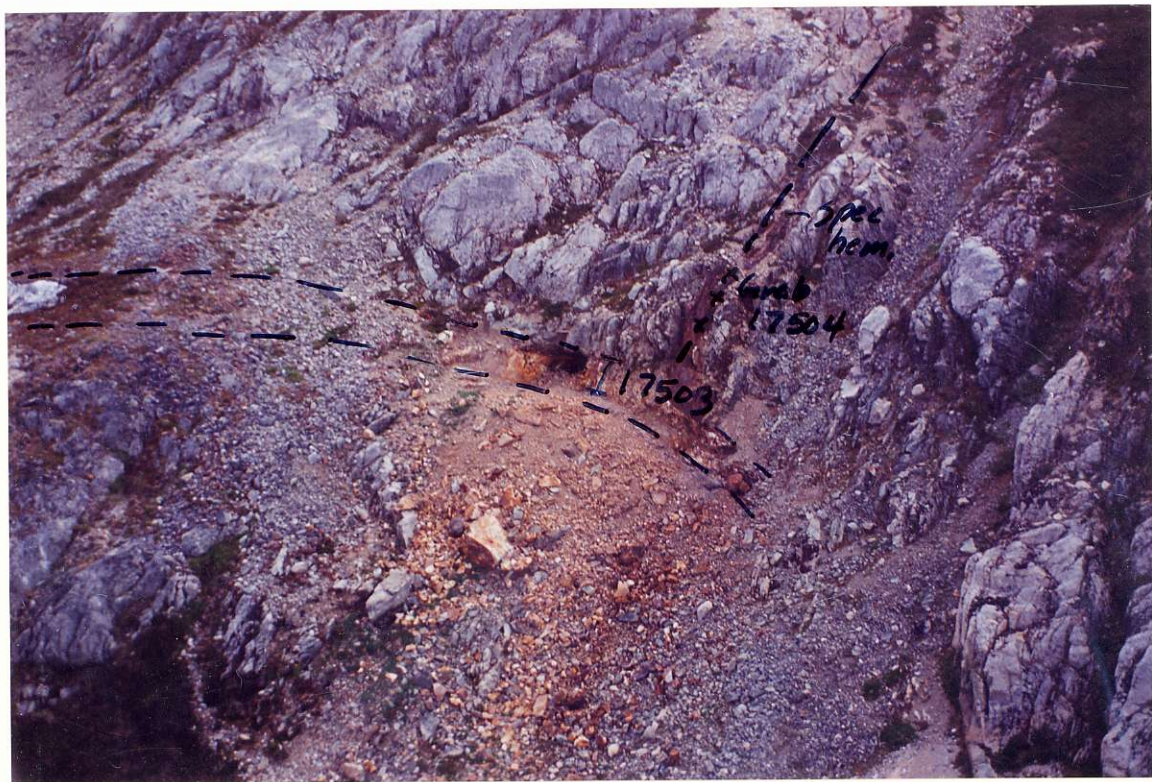
SITE 10 :10A VEIN B