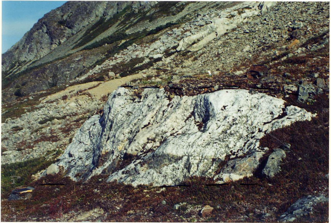
site 9 veinB sample 17502