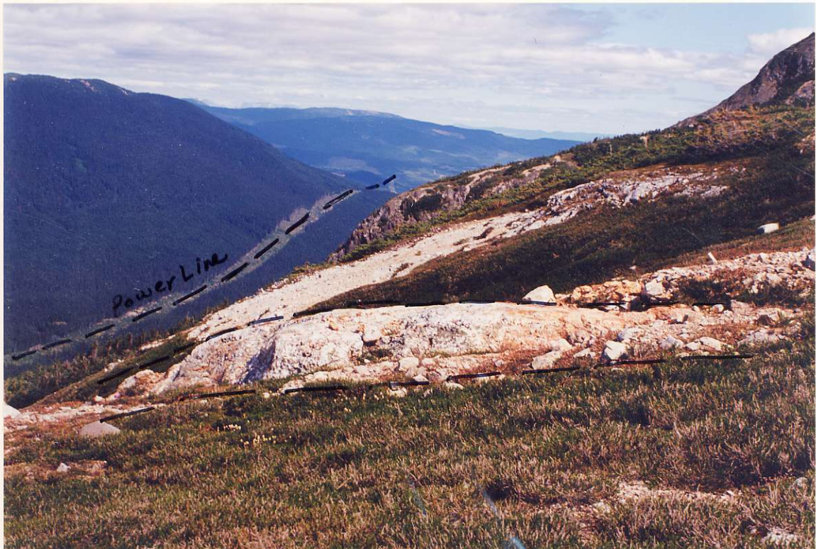
site 4 vein B