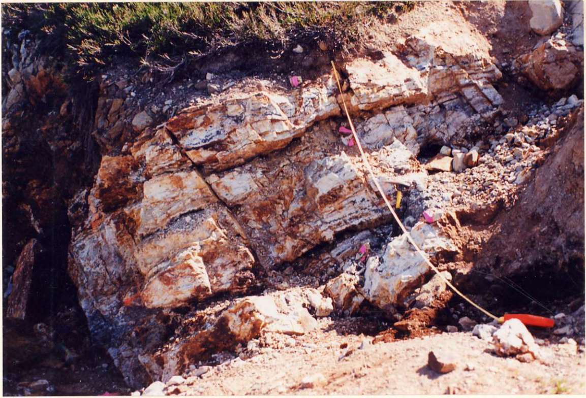
VEIN A - galena, sphal, cpy - banded.