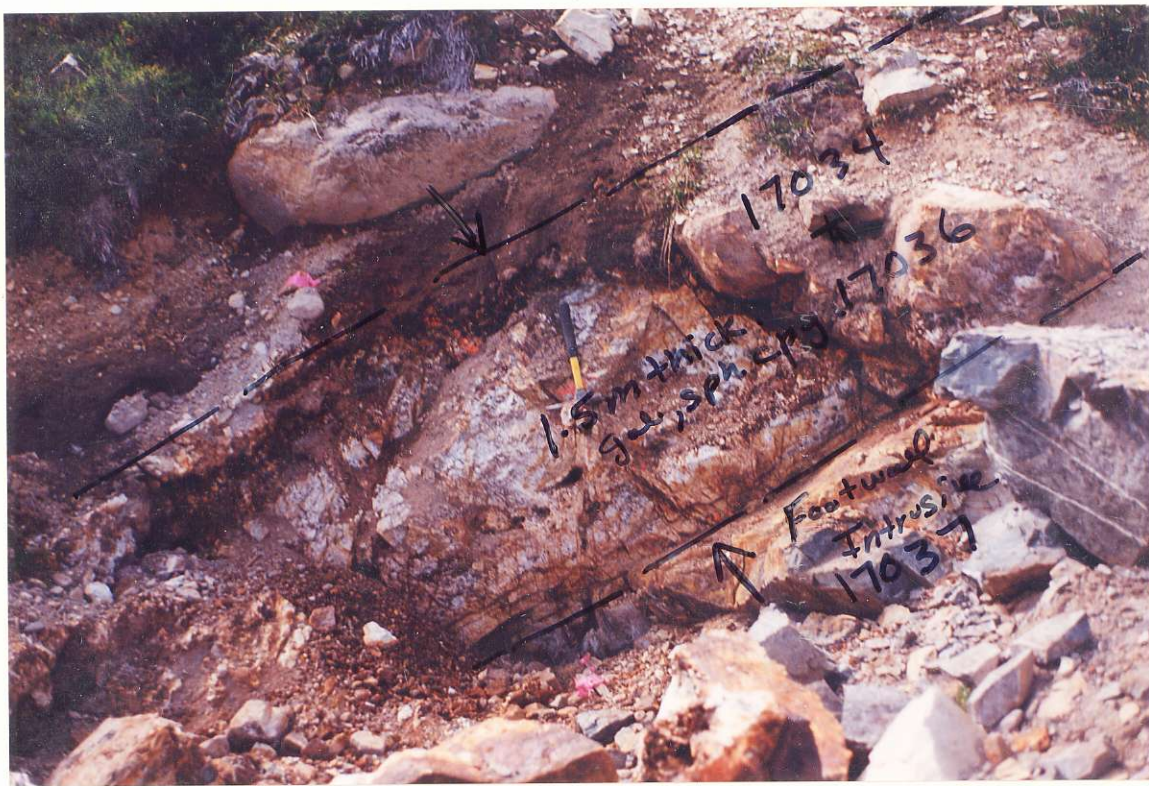
VEIN B - site 1 200° strike 45° dip SE