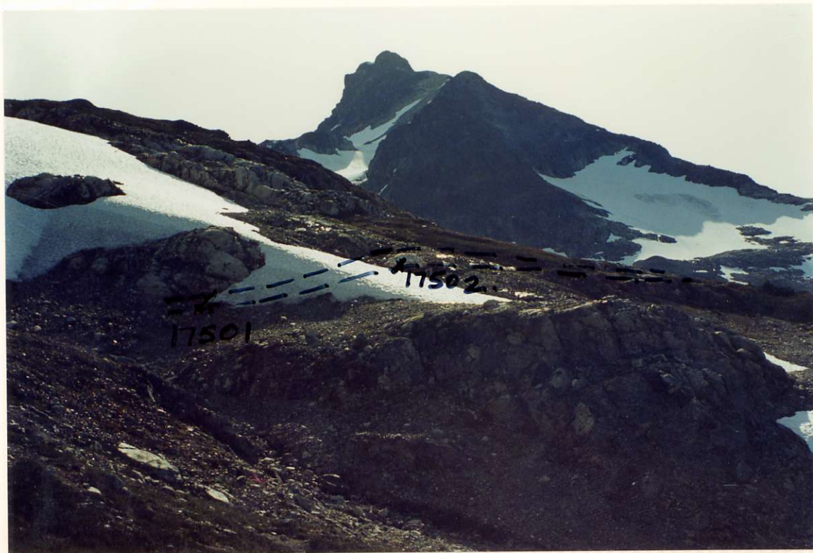
VEIN B - To South west