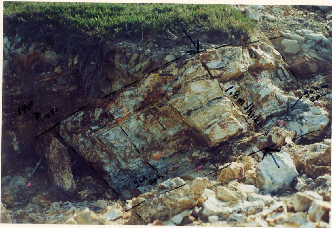
VEIN A 204° strike, 31° dip SE