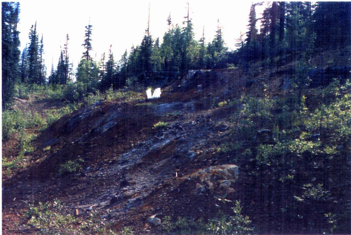
ZONE A SKARN

DALZIEL ZONE 250,000 TONS 9% Pb-Zn. 1.5 Ag.