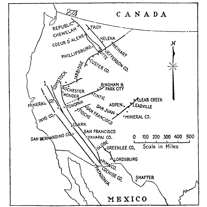
FIG. 75.—Principal silver camps of the Western United States. Based on Plate 48, "World Atlas of Commercial Geology," Part I., U. S. Geol. Surv., 1921. The crosses indicate the principal productive camps in 1918. The lines indicating ore belts or ore channels, and the recognition of the alignment into two systems, northeast and northwest, are my own.

Aabro Mining & Oils Ltd. — Change of name in 1968 and consolidation of properties, of which Mother Lode and Cumberland are principal components, with sizeable production at various periods up to 1962. At October, 1969, ore reserves reported at 701,378 tons proven and 740,159 probable in the Mother Lode mine with grade of 0.65% copper and a further 792,395 tons of 0.79% in the Greyhound mine. Enlargement of