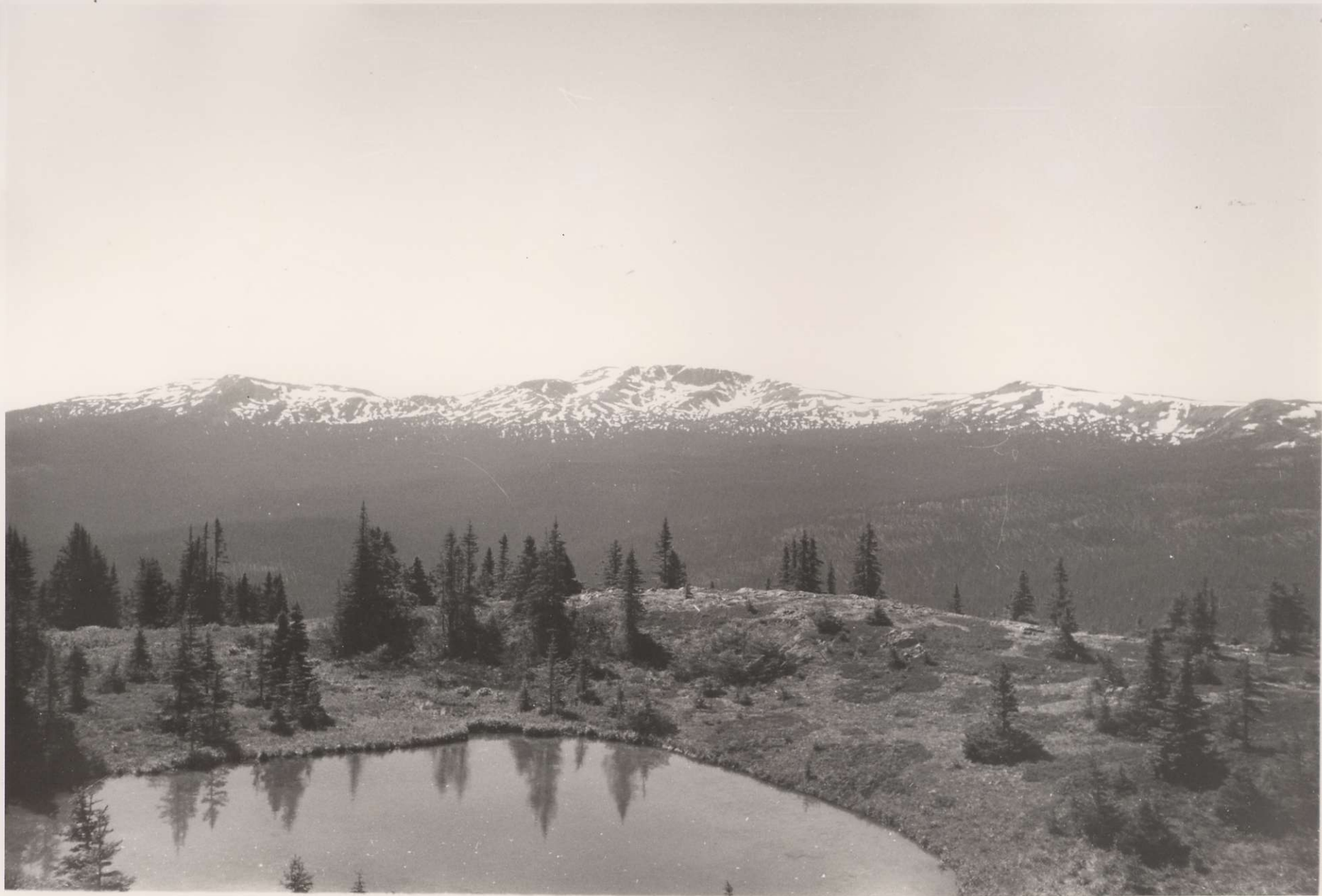
MOUNT NATION - JULY 13, 1973 looking south.