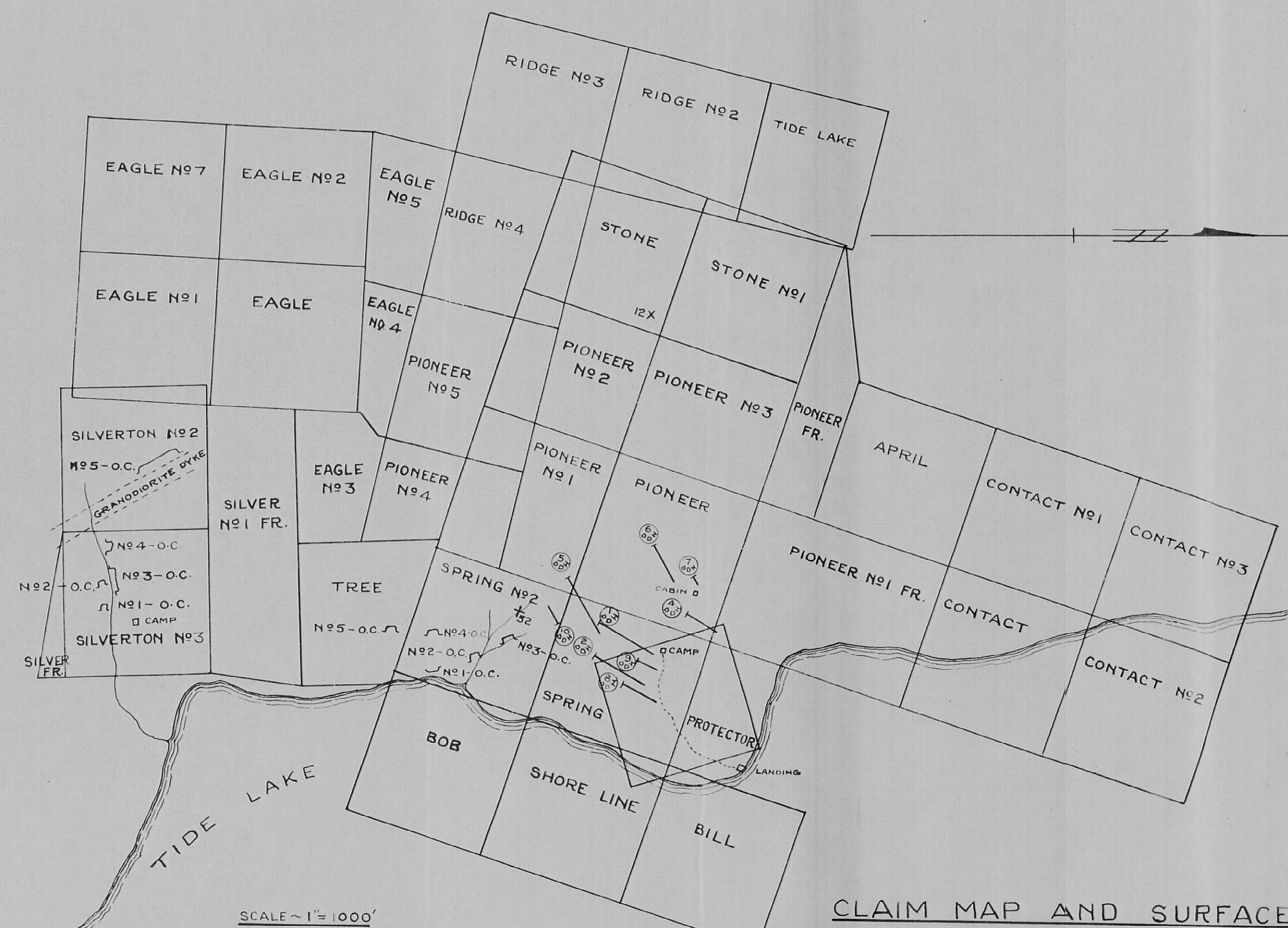
CLAIM MAP AND SURFACE SAMPLING BY C. M. & S. COMPANY