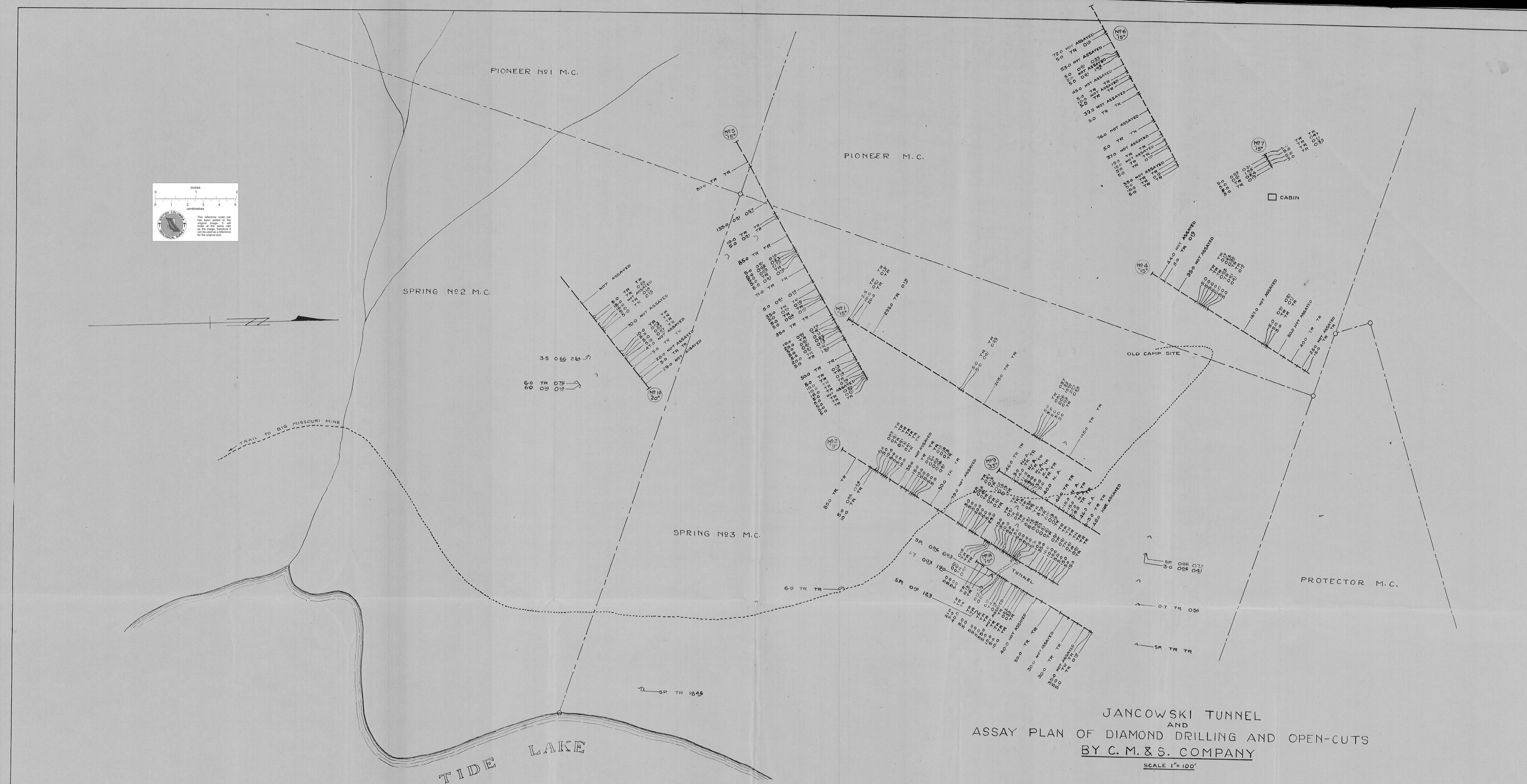
JANCOWSKI TUNNEL AND ASSAY PLAN OF DIAMOND DRILLING AND OPEN-CUTS BY C. M. & S. COMPANY SCALE 1"=100'