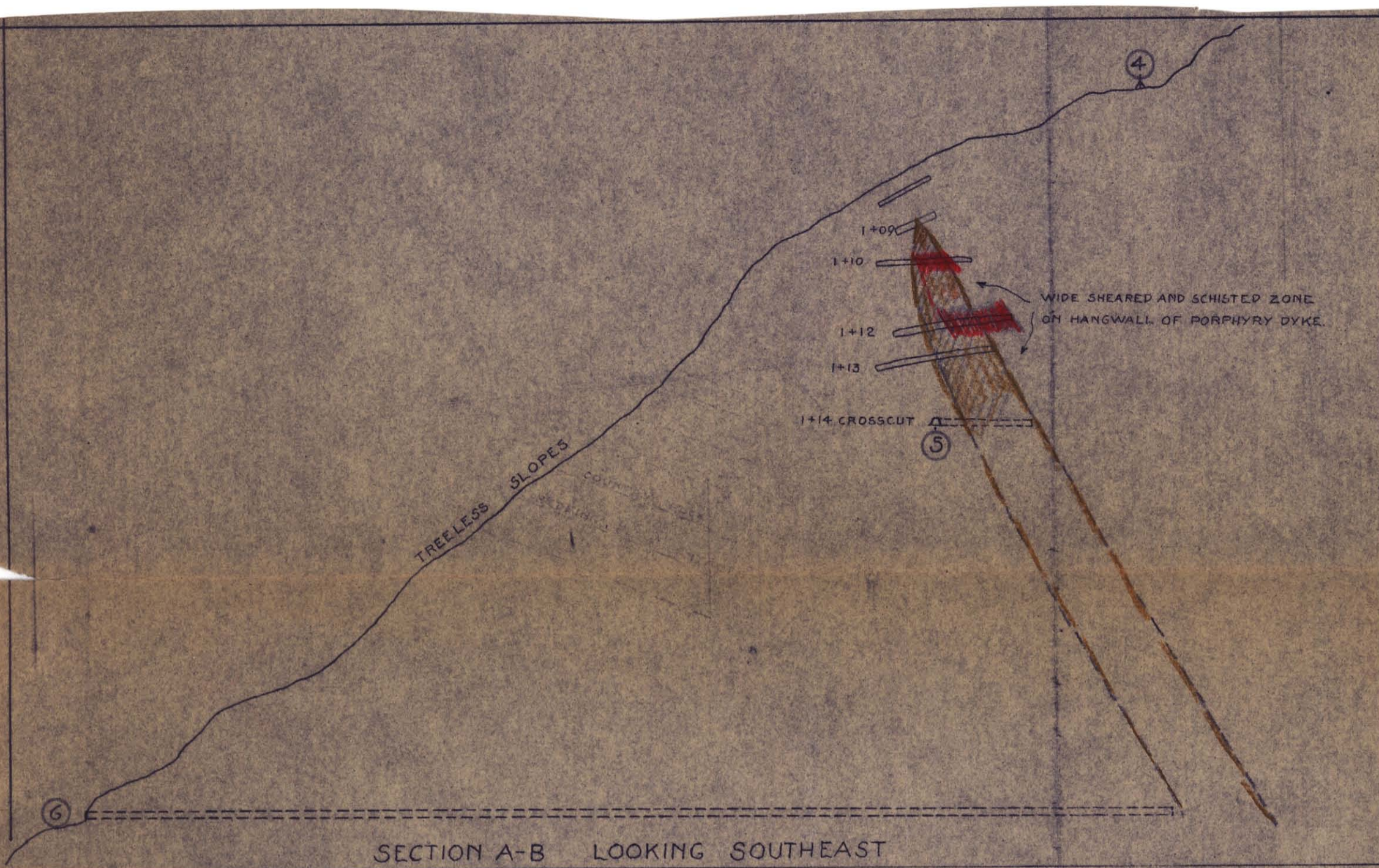
SECTION A-B LOOKING SOUTHEAST