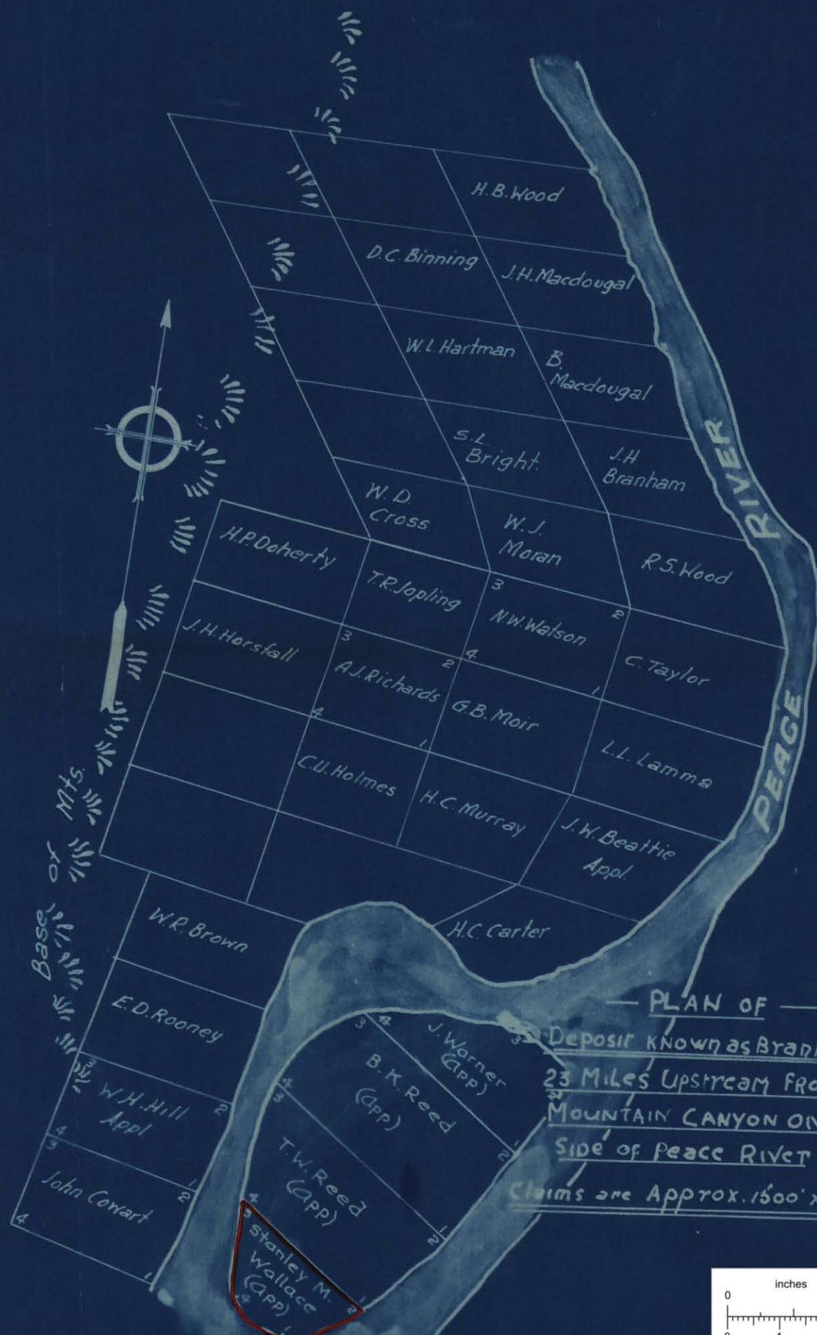
— PLAN OF — Deposit known as Branham Flats 23 Miles Upstream from Rocky Mountain Canyon on North Side of Peace River Claims are Approx. 1500' x 2300'