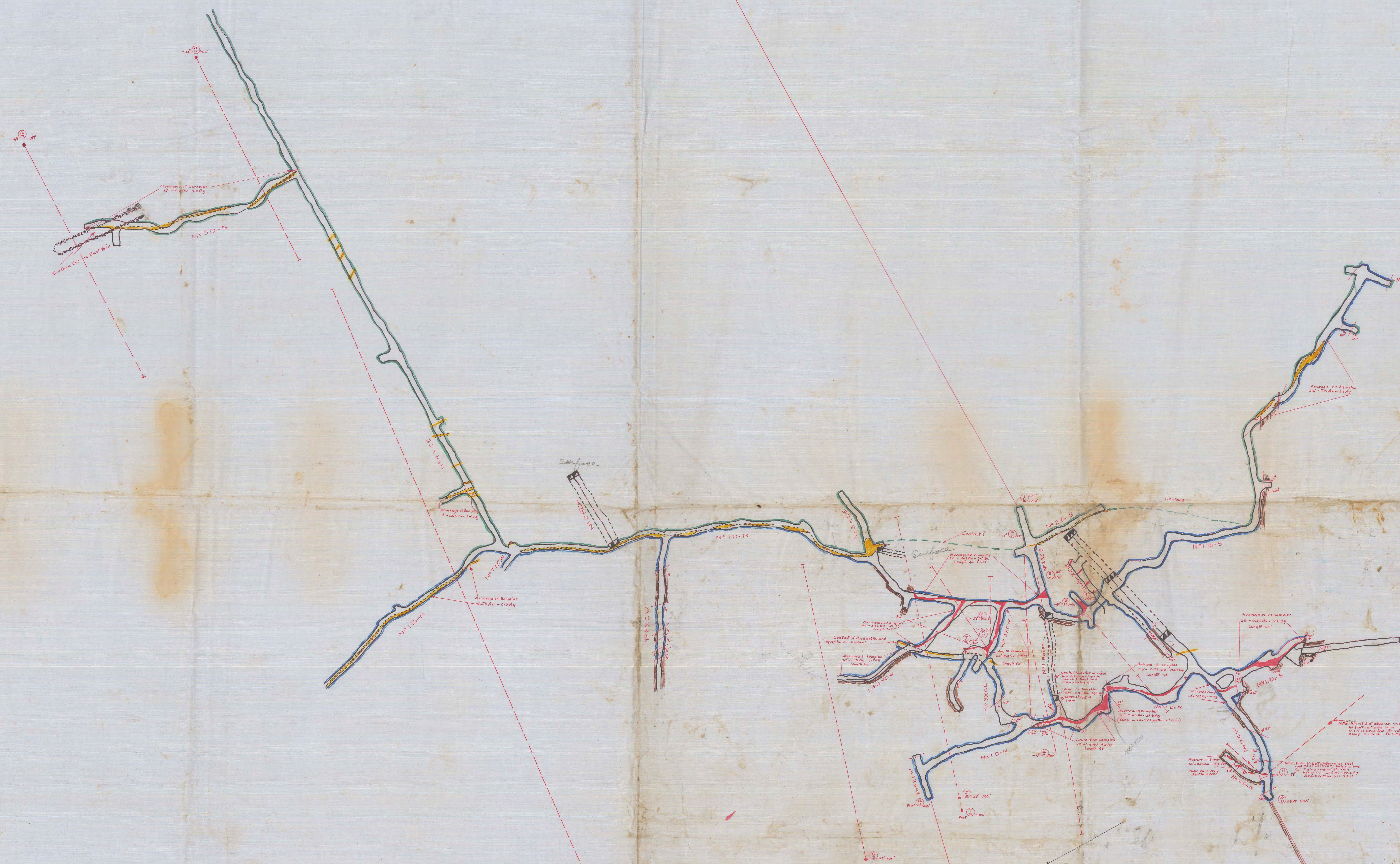
TOPLEY RICHFIELD MINE COMPOSITE PLAN SHOWING AVERAGE VALUES AND GENERAL GEOLOGY Scale 1" = 30 feet