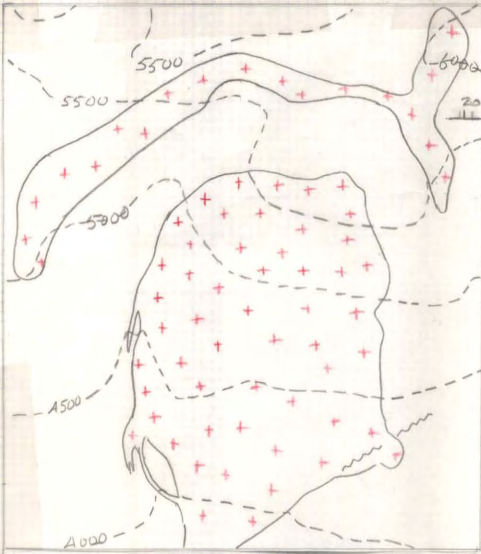
FIG. 10 GEOLOGY OF RED BIRD PROSPECT