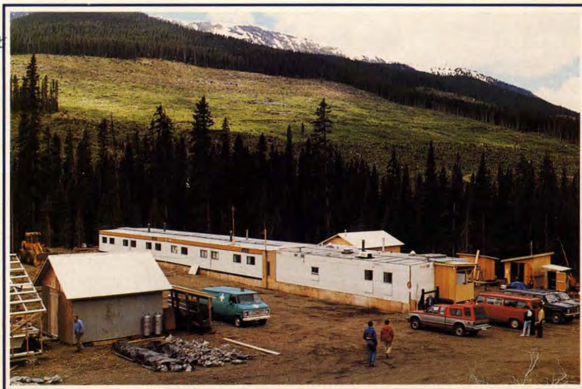
Camp at the Frasergold Project Site.

Although Southlands continues to press forward on the Frasergold, its market performance has been somewhat handicapped by litigation instigated by its 50% joint venture partner, Eureka Resources. It is Dynamic's understanding that this dispute should be resolved in the near future by binding arbitration. Southlands has agreed to share its interest with Sirius Resource Corporation, which was brought in to provide funding and technical expertise to maintain the tempo of the exploration program.