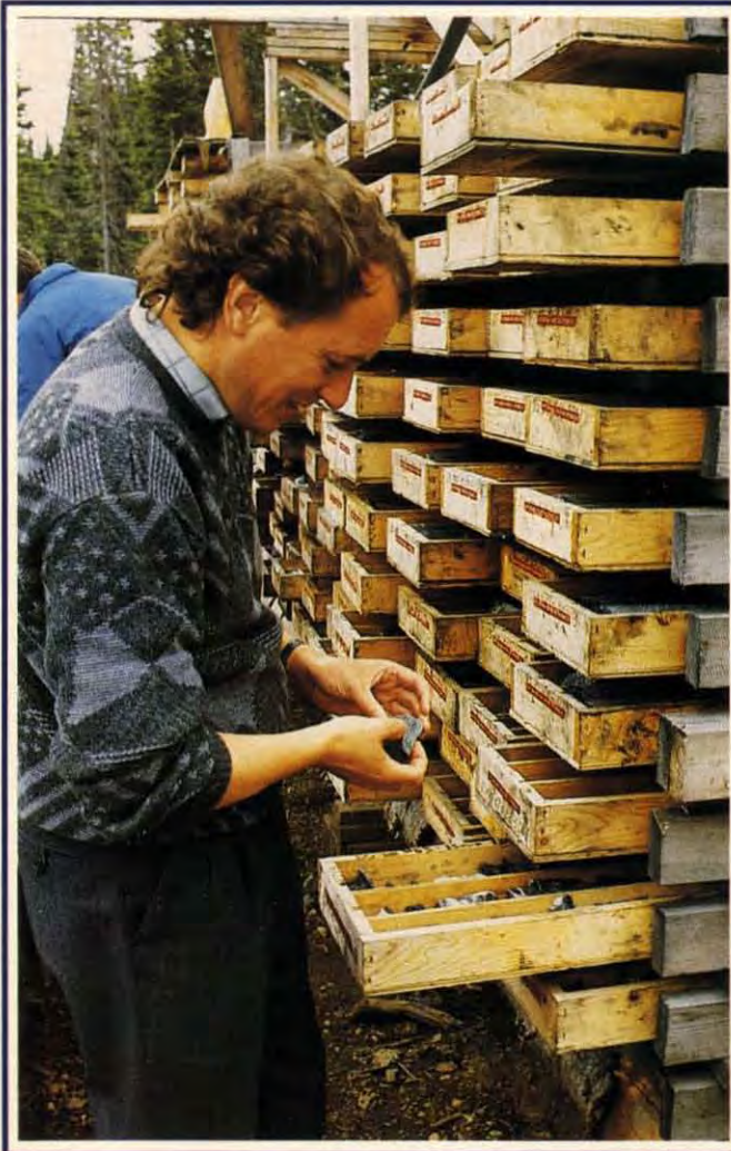
The President examining drill core.