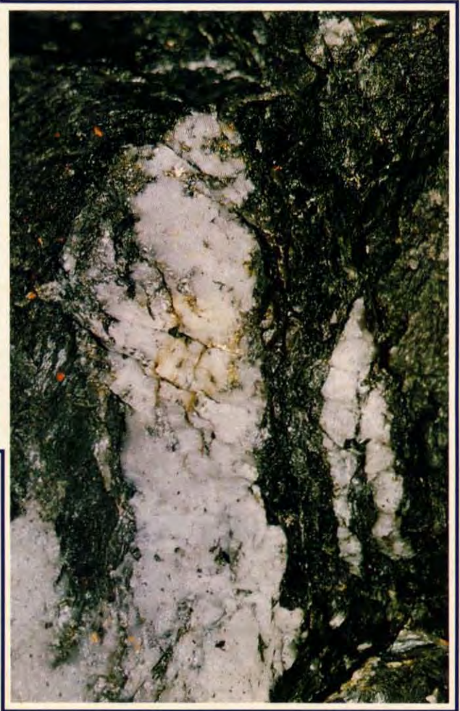
Gold bearing quartz veins.

Even with the intensity of commitment being expended on the Frasergold, company management and consultants are actively developing plans for other properties with a view to making them future producing mines.