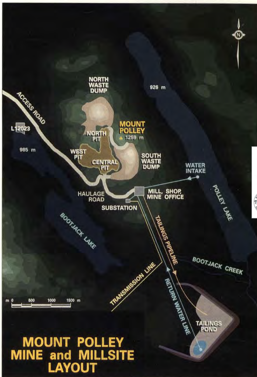
Application has been made for Stage 1 approval of the Mount Polley mine and mill in central B.C.

The Mount Polley intrusive complex is a multiple alkalic laccolith