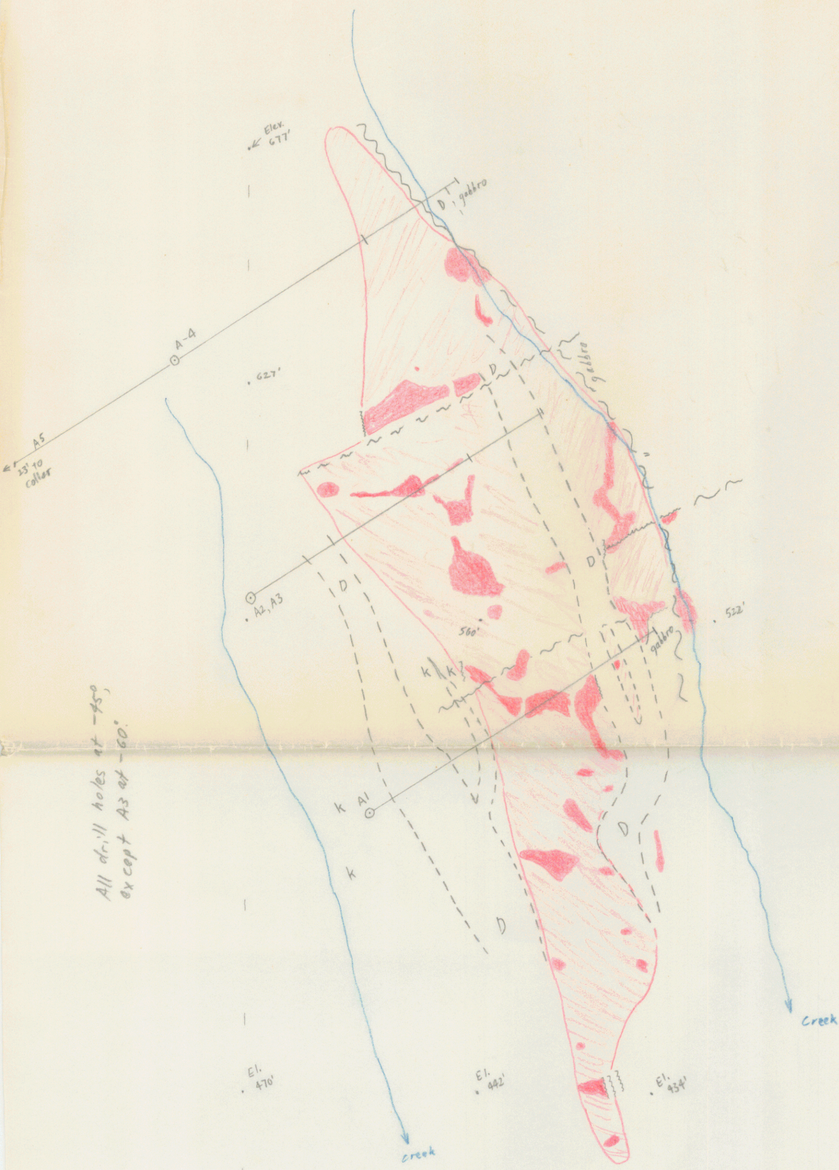
POWER RIVER ZONE A GEOLOGY 1" = 40' Drawn May '12 by R.S. Adams Traced Aug '12 - G.E.P. Eastwood