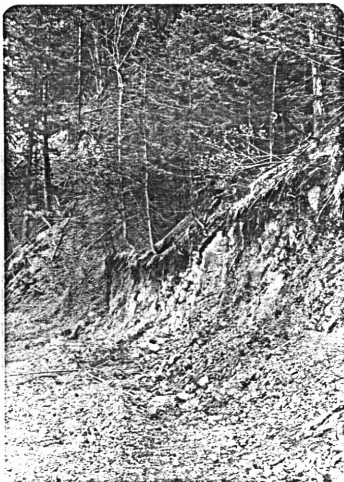
Lower trench on way out along tote road. View to SE