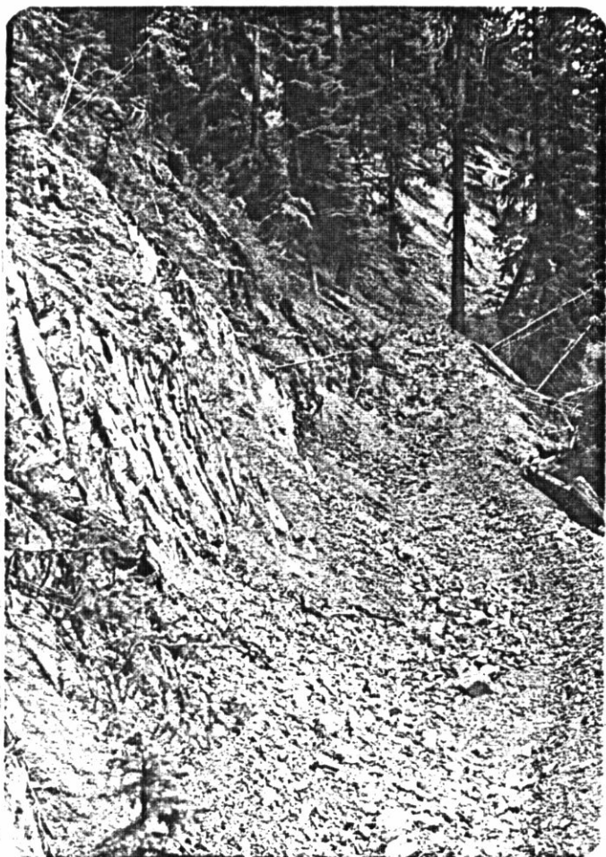
Acacia Minerals--lower trench of the two upper trenches. View NW.