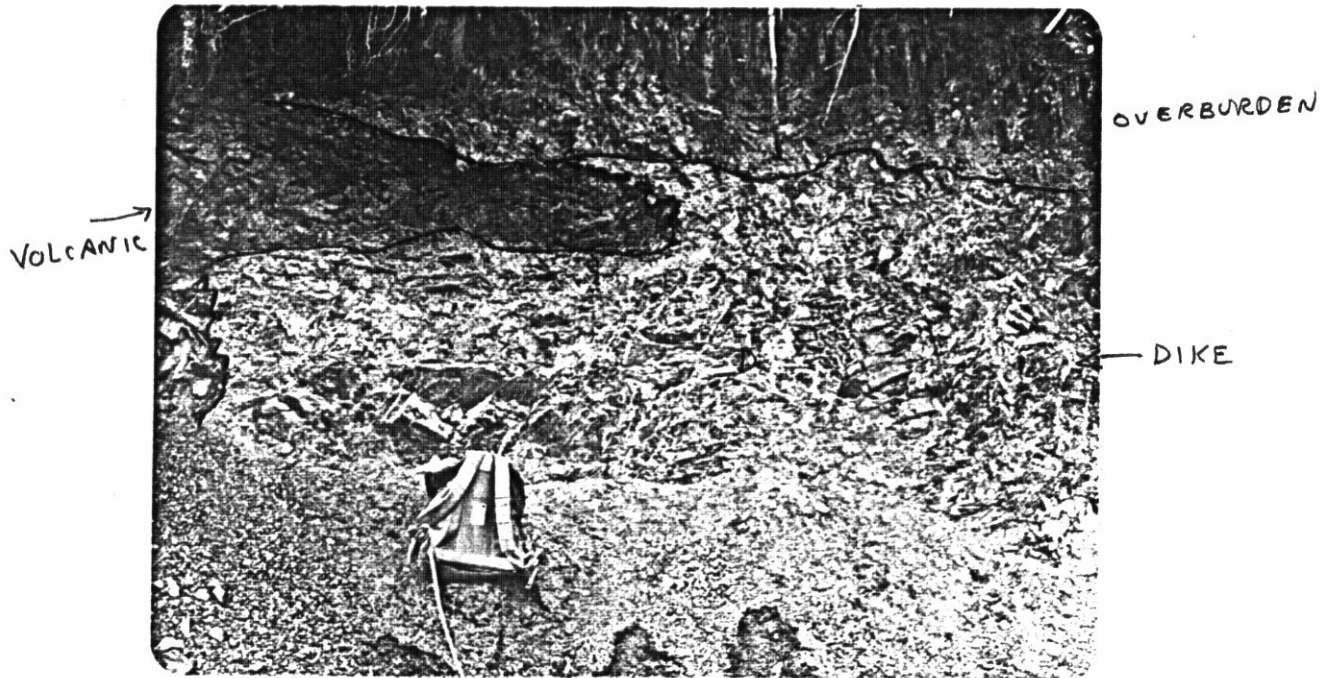
Acacia. Porphyry dike into dark volcanics on road on the way out of property exposed in road cut.