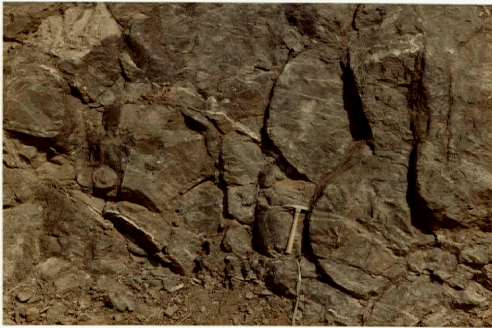
6. Karmutsen Formation: Pillow Basalts