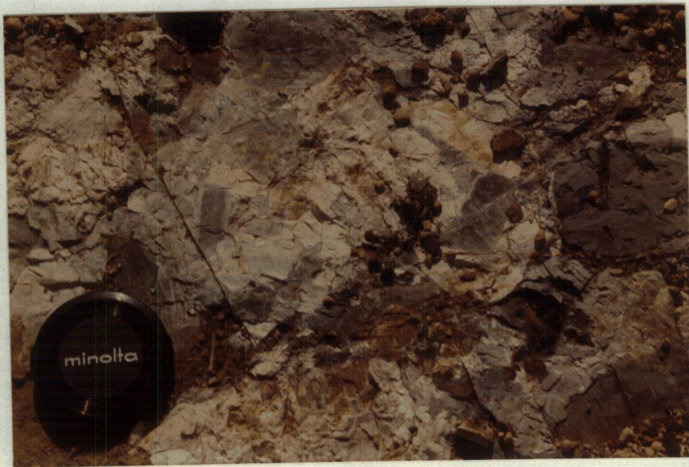
4. Sicker Group, Myra Fm: Chert-tuff breccia