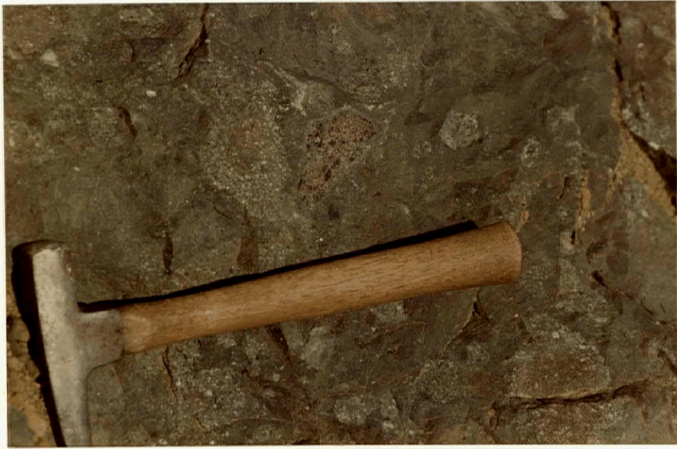
5. Myra Formation: Agglomeratic Lapilli Tuff