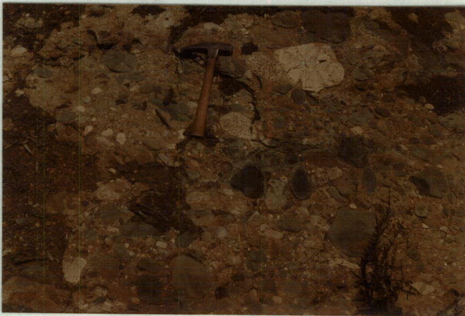
7. Nanaimo Group. Polymictic Conglomerate