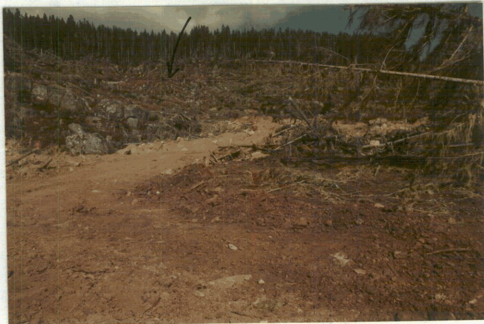
11. Hematite - Villalta Showing, looking north towards site of holes DDH 84-V-24, 25