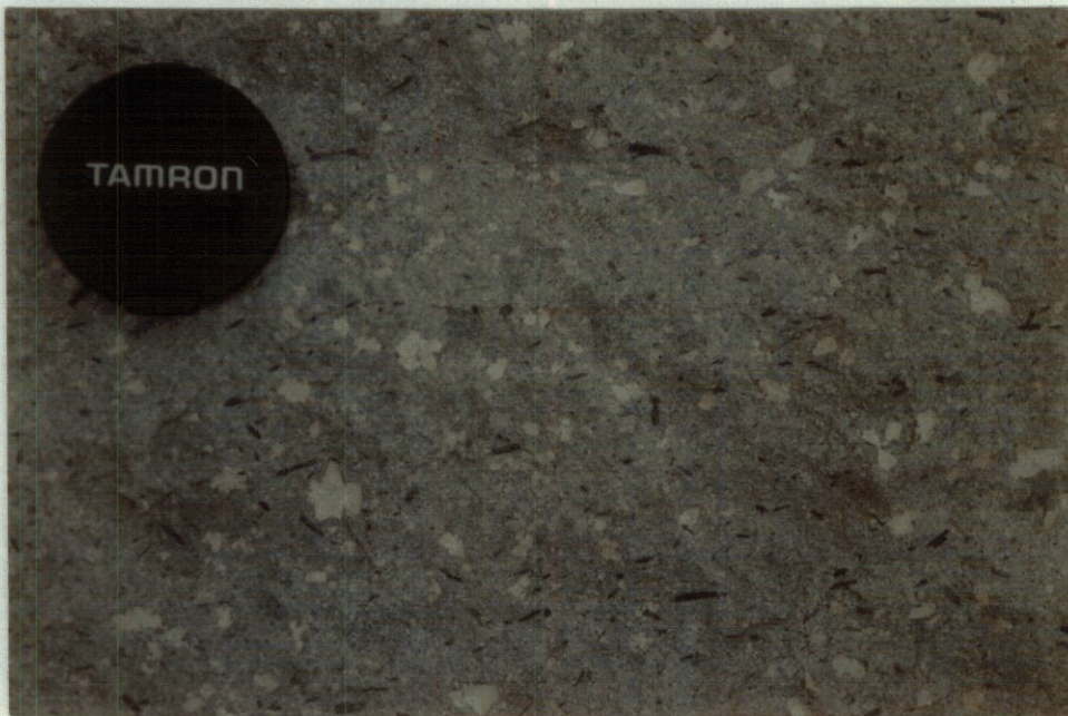
8. "Catface" Tertiary Sill - Hornblende Feldspar Porphyry