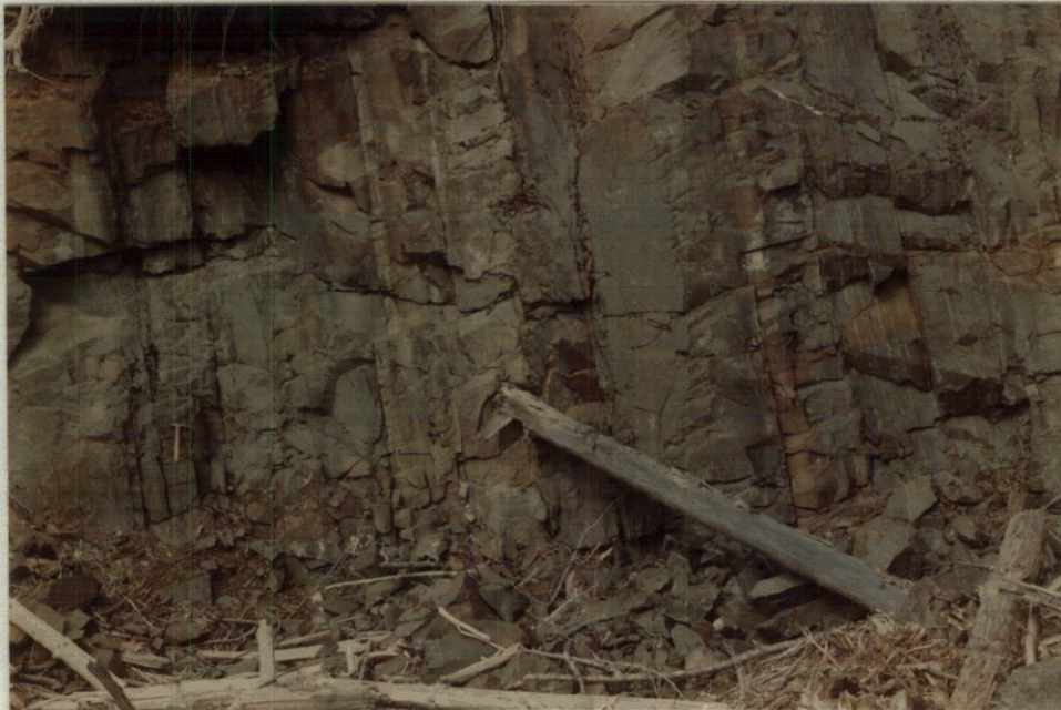
3. Sicker Group, Myra Fm. Thick bedded tuffs. Note hammer for scale