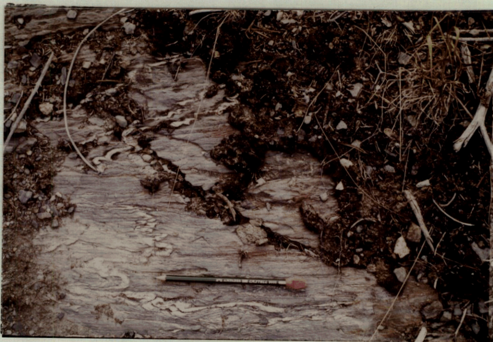
Plate 2a Ptygmatically folded quartz veins in black phyllite