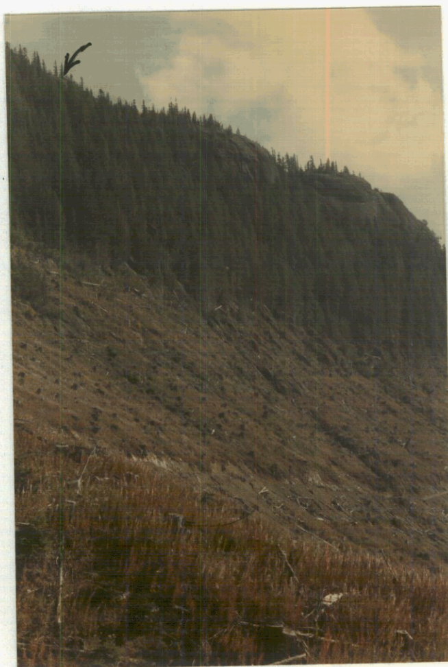
12. Torchy Cu-Ag Showing drill site. Note bluffs of Nanaimo Group Sediments