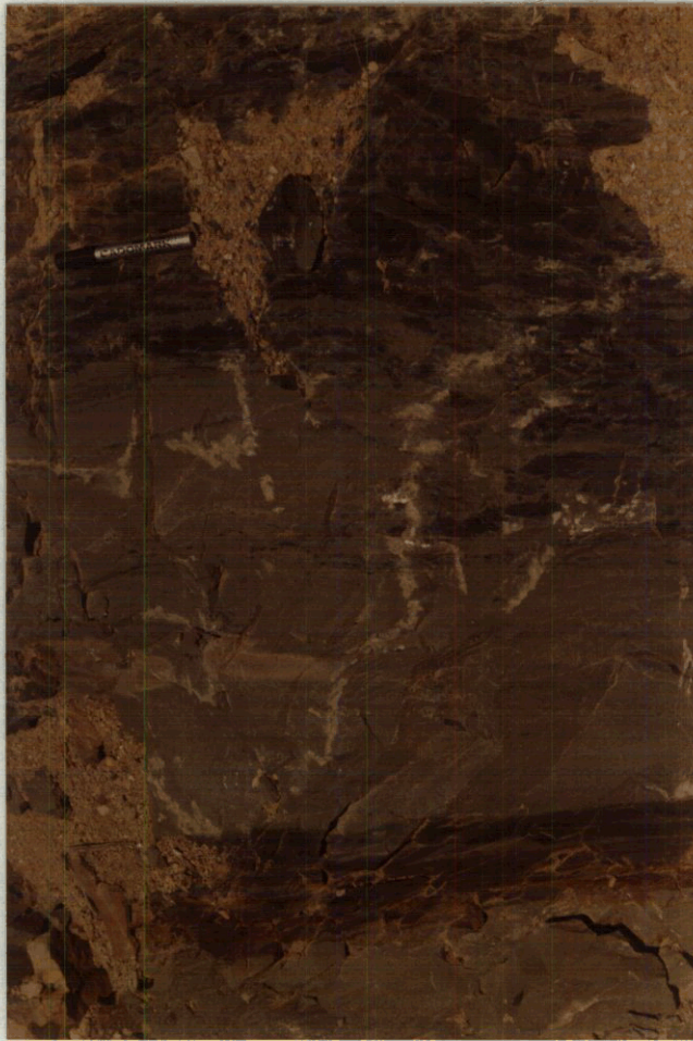
1. Sicker Group, Myra Fm: Interbedded green, f.g.-m.g. tuff and f.g. black tuff/argillite