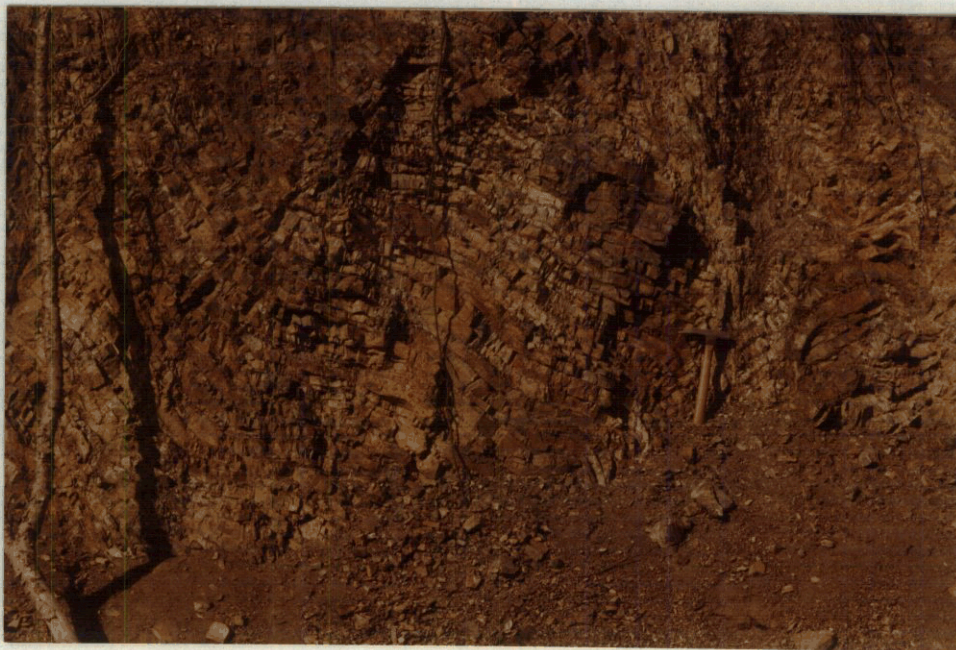
2. Sicker Group, Myra Formation: Thin bedded argillites