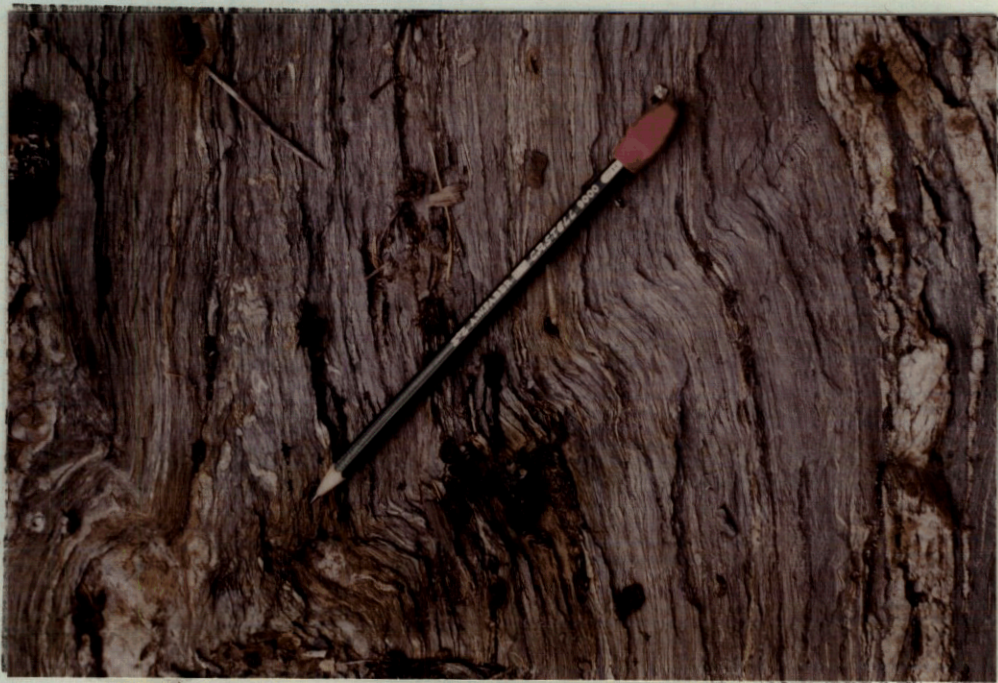
Plate 2b Reverse kink band in black phyllite